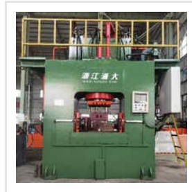
Tee Cold Forming Machine