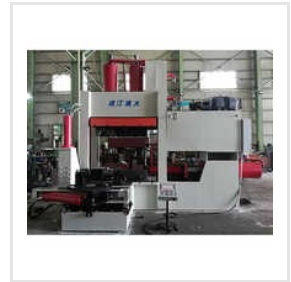
Elbow Cold Forming Machine