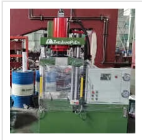
Double End Elbow Beveling Machine