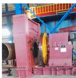
SINGLE END ELBOW BEVELING MACHINE