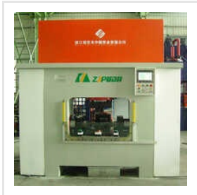
Inner High Pressure Water Expanding