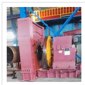
Single End Elbow Beveling Machine