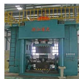
THREE WAY PIPE FITTING EXPANSION HYDRAULIC PRESS