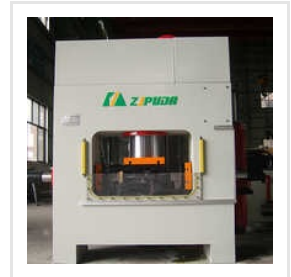
Water Bulging Forming Machine