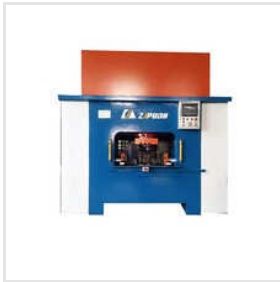
Pressing Water Bulging Forming Machine