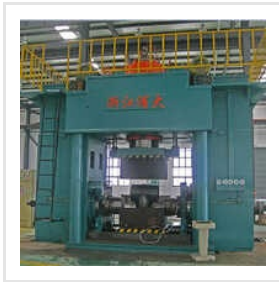
Three Way Pipe Fitting Expansion Hydraulic