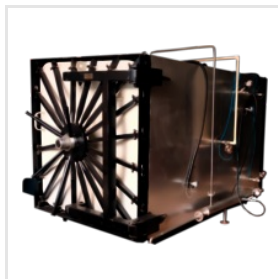
FULLY AUTOMATIC ETOSTERILIZER MACHINE