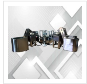
Automatic Syringe Assembly Machine