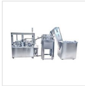
Fully Automatic Syringe Printing