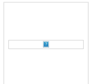
Ribbon Packing Machine