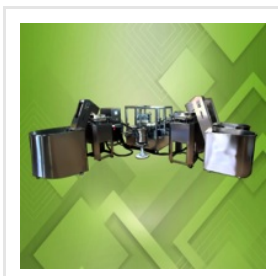
Automatic Syringe Making Machine