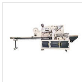
Disposable Syringe Packing Machine