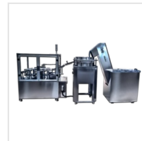
Automatic Assembly Machine