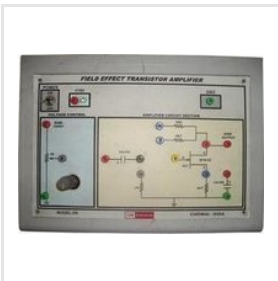
Transistor Amplifier Trainer