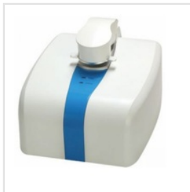
Bio- Nano Spectrophotometer