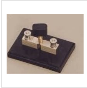
One -Way Plug Key