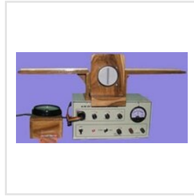
E/M By Thompson Method (Bar Magnet)