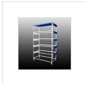
Portable Tissue Culture Rack