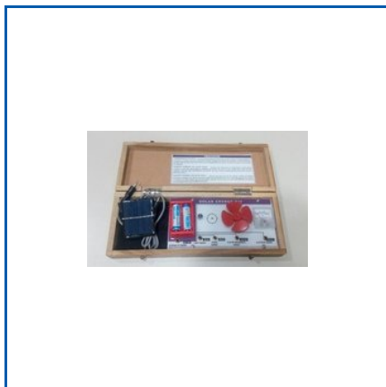
SOLAR ENERGY KIT