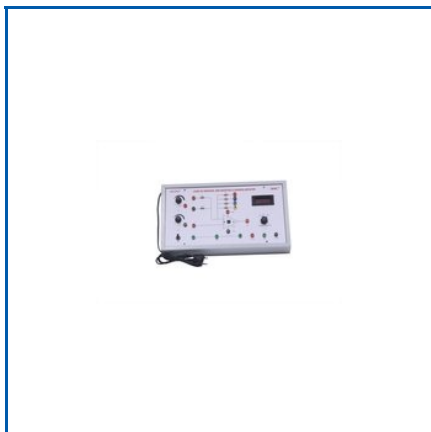
OPERATIONAL AMPLIFIER AS INVERTING & NON-INVERTING

1 16 Line Demultiplexer Ic 74154, 1 2 Line Demultiplexer Ic 74155, 1 4 Line Demultiplexer Ic 74155, 1 8 Line Demultiplexer Ic 74138, 16 1 Multiplexer Ic 74150, 4 1 Line Multiplexer, 4 Bit Adder And Subtractor Using Ic 7483, 4 Bit Binary To Gray Code Convertor, 4 Bit Up Down Counter, 8 1 Multiplexer Using Ic 74151, Abbe Refractometer, Airth Matic Logic Unit Alu, All Glass Distillation Apparatus, Ammeter, Amplitude Modulation Demodulation, Etc.