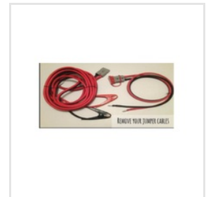
Booster Cable Set