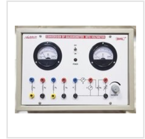
CONVERSION OF GALVANOMETER INTO A