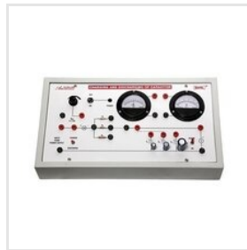
CHARGING DISCHARGING OF