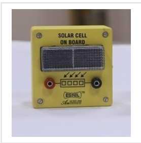
Solar Cell On Board