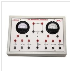
LCR RESONANCE APPARATUS