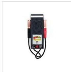
Battery Load Tester