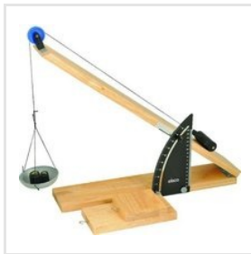
Friction Board Apparatus