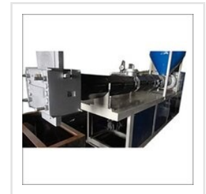
Plastic Dana Making Machine