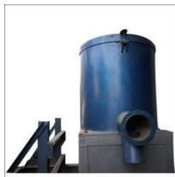
PLASTIC MIXER MACHINE