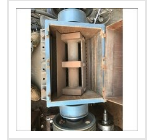
Plastic Scrap Grinder Machine