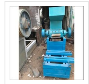
Plastic Scrap Grinder Machine