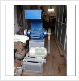
Plastic Scrap Grinder Machine