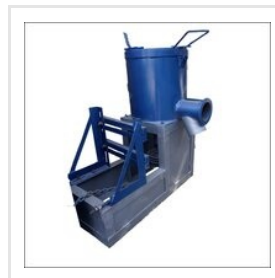
Plastic Mixer Machine