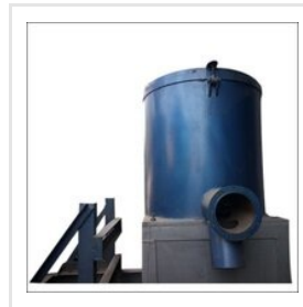
Plastic Mixer Machine