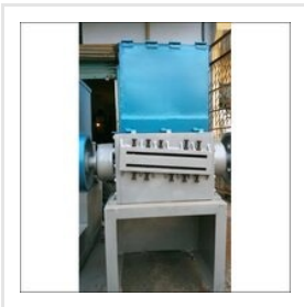
Plastic Scrap Grinder Machine