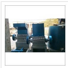
Plastic Scrap Grinder Machine