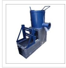
Plastic Mixer Machine