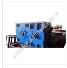
Plastic Dana Machine