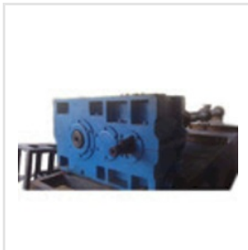
Plastic Dana Making Machine