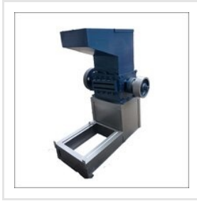
Plastic Scrap Grinder Machine