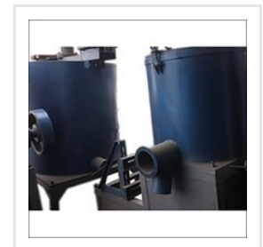
Plastic Mixer Machine