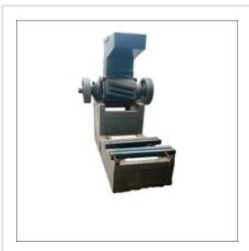
Plastic Scrap Grinder Machine