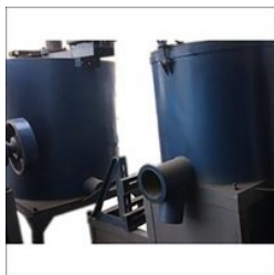
PLASTIC MIXER MACHINE

Agro Mixer Machinery, Color Mixer Machine, Dana Cutter Machine, Extruder Barrel, Extruder Machine, Foot Hand Sanitizer Machine, Granules Mixer Machinery, Heavy Plastic Scrap Washing Machine, High Speed Agro Mixer Machine, Hydro Extractor, Plastic Blowing Moulding Machine, Plastic Color Mixer, Plastic Dana Cutter, Plastic Dana Machine, Plastic Dana Making Machine, etc.