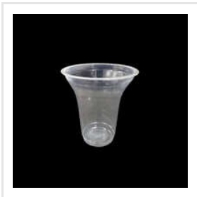
Mocktail Disposable Glass