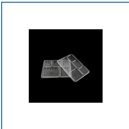
5 COMPARTMENT DISPOSABLE MEAL TRAY