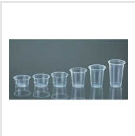
Disposable Plain Glass