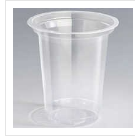
250ml Plain Disposable Glass