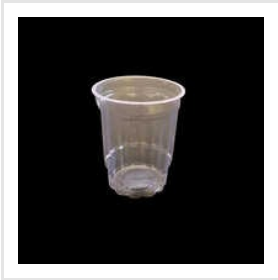
250ml Disposable Flower Glass