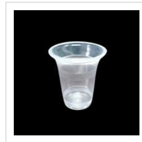
95ml Bru Disposable Glass