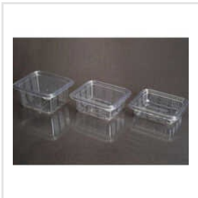
Disposable Hinged Container