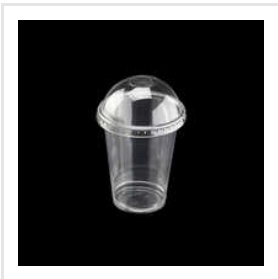
Dome Disposable Glass