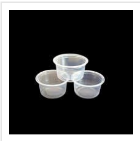
100ml Disposable Ice Cup