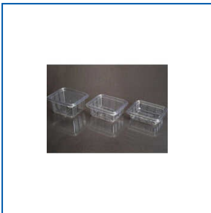
DISPOSABLE HINGED CONTAINER

100ml Disposable Ice Cup, 250ml Disposable Flower Glass, 250ml Plain Disposable Glass, 250ml Spiral Disposable Glass, 5 Compartment Disposable Food Tray, 5 Compartment Disposable Meal Tray, 95ml Bru Disposable Glass, Disposable Hinged Container, Disposable Plain Glass, Dome Disposable Glass, Mocktail Disposable Glass, Tower Disposable Glass, etc.