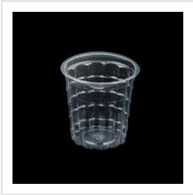
Tower Disposable Glass