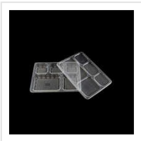
5 Compartment Disposable Meal Tray