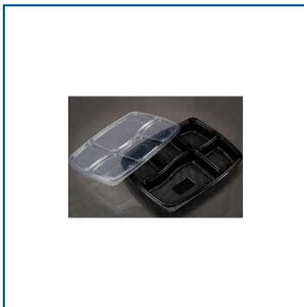
5 COMPARTMENT DISPOSABLE FOOD TRAY