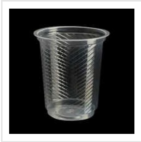
250ml Spiral Disposable Glass