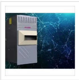
7G Drykool 4K Duct Cooler Zero Humidity