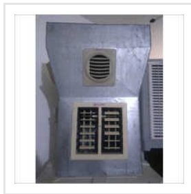
Duct Air Cooler Duct Fabrication