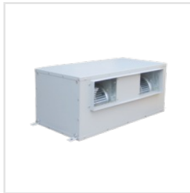
Active Split Commercial Ducting