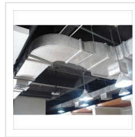
PIR Duct Polyisocyanurate