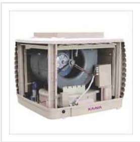
5G KAAVA HYPER COOLER TORNADO 20K