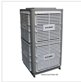
Active Cooling Technology Ductable