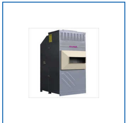
HYBRID-2K HYBRID INDIRECT EVAPORATIVE AIR CONDITIONING