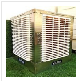
Ductable Super Cooler - Thunder 10K - SS