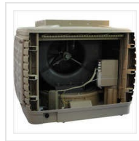
Kaava 5G Tornado 20K Premium Hyper Duct