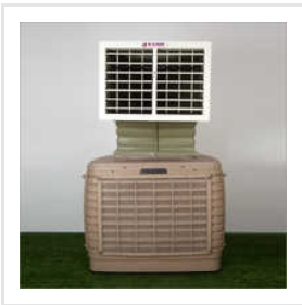
Industrial Hyper Air Cooler