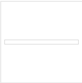
Commercial Compact Ductable Hyper Air