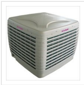
Premium Zero Noise Super Silent Natural