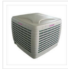
Tornado 20K Cool Industrial Hyper Duct