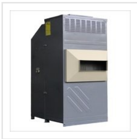
2K-7G Hybrid Indirect Evaporative Industrial