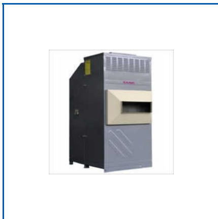
KAAVA 7G DRYCOOL 2K HYBRID COOLER ZERO HUMIDITY ADDITION FOR 300 TO 600 SQFT AREA

12K Heavy Duty Mobile Range Tent Cooler, 2K-7G Hybrid Indirect Evaporative Industrial Air Cooler, 30K - 3G Heavy Duty Mega Cooler, 35K - 4G Heavy Duty Mega Cooler, 3G Cooler Typhoon 20K, 3G Duct Air Cooler for Departmental Store, 3G Eco Cooler Typhoon 17K, 3G Eco Cooler Typhoon 23K, 3G Industrial Duct Air Cooler For Warehouses, etc.