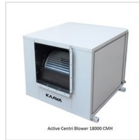
Commercial Active Split Ducting Cooler