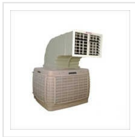
5G Tornado 20K Duct Cooler