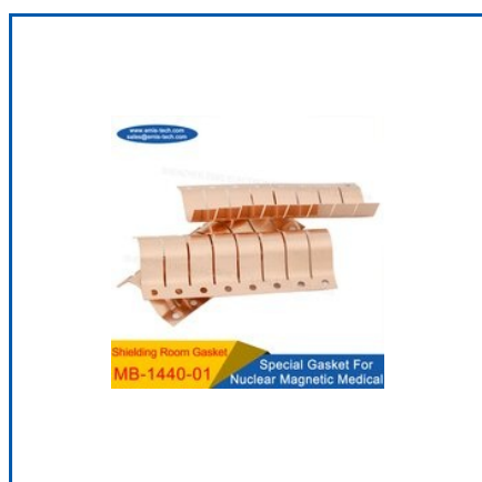
SHIELDING ROOM GASKET

0.8mm SMD Spring, 409 mm Shielding Room Gasket, Aluminum Fabric Over Foam, Aluminum Honeycomb Ventilation Panel, Antistatic Conductive Copper Foil Tape, Assembled Model Becu Gasket, BeCu EMI Shielding Gasket, BeCu ESD Fingerstock, BeCu Spiral Tube, BeCu twist gasket, Becu Clamped Fingerstock, Becu Gasket And Fingerstock, Becu Small Contact Spring, Becu Snag Gasket, Becu Spring And Fingerstock, etc.