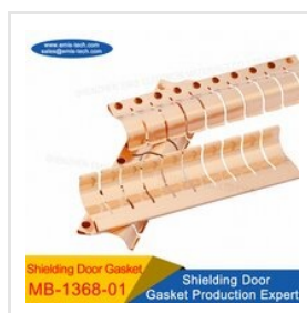
Shielding Door Gasket