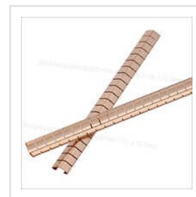
Standard Length Singe Slot Becu Strip