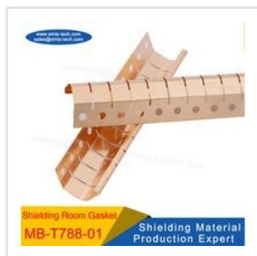
EMI Shielding Room Gasket