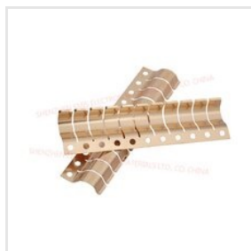
Shielding Door Spring