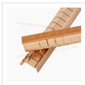
Shielding Room Fingerstock