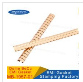
Dome BeCu EMI Gasket