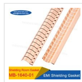
EMI Shielding Gasket