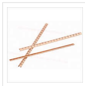
Bright Finish Super Soft Becu Gasket