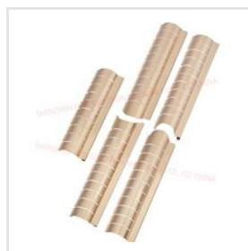
Shielded Room Fingerstock