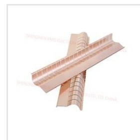
Shielding Door Fingerstock