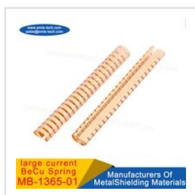
Large Current Becu Spring