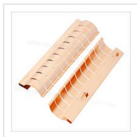
409 Mm Shielding Room Gasket