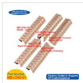
Shielding Room Strips