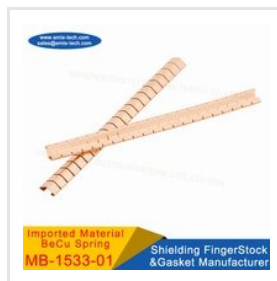
EMI Shielding Fingerstock