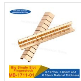
Big Single Slot Fingerstock