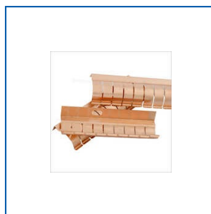
BRIGHT FINISH SHIELDING ROOM GASKET