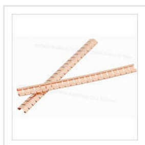
Standard Length High Performance Becu