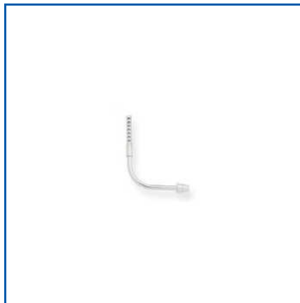
GENERAL DISSECTING FORCEPS