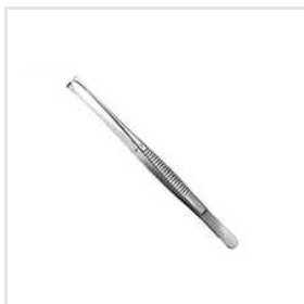
Russian Forceps Stainless Steel