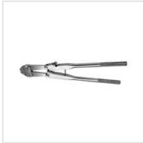
Orthopedic K - Wire Nose Pliers Cutters And