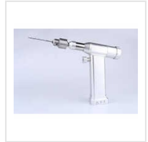
Orthopedic Hand Drills And Accessories