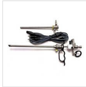
Monopolar Turp Resectoscope Set