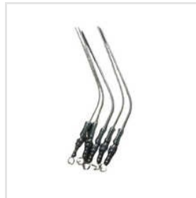
E. N. T Suction Tips