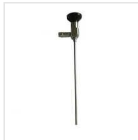
4mm 30 Degree Cystoscope