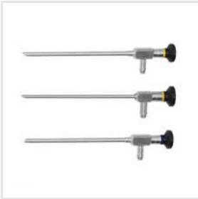
Otology General Instruments