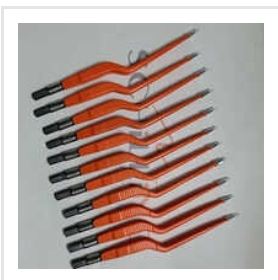
Bayonet Bipolar Forceps