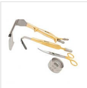
Plastic Surgery Instruments Set