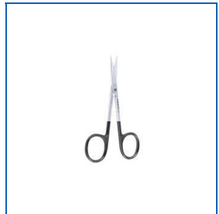
SCHILLING TENATOMY SCISSOR