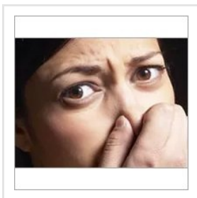
Odor Control Chemicals