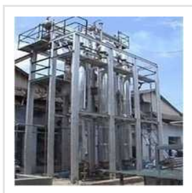
Evaporator Antiscalant Chemical