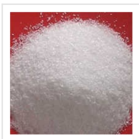
Non Ionic Polyelectrolytes