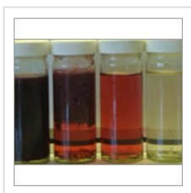
Color Removal Chemical