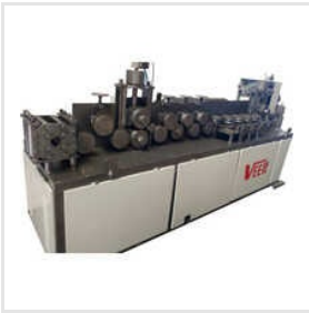
TMT Wire Straightening Machine Advance-812