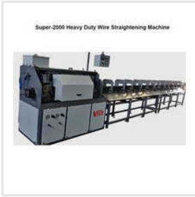
Super-2000 Heavy Duty Wire Straightening Machine