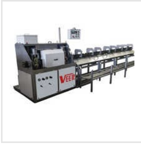
Plain Wire Straightening Machine