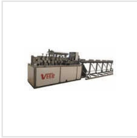
TMT Wire Straightening Machine EC-608