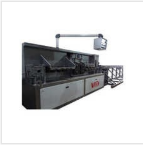
TMT Wire Straightening Machine WST-12