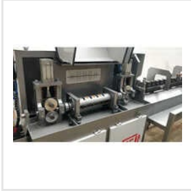
Wire Straightener Cutter Machine