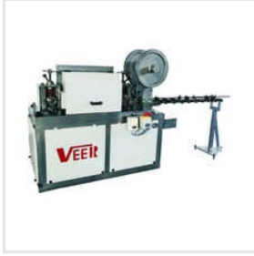
Plain Wire Straightening Machine