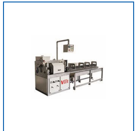
PLAIN WIRE STRAIGHTENING MACHINE SUPER 500