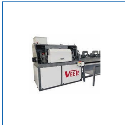
PLAIN WIRE STRAIGHTENING MACHINE SUPER 700 ECO