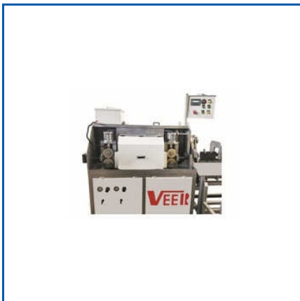
PLAIN WIRE STRAIGHTENING MACHINE SUPER 700

10 Mm Wire Straightening And Cutting Machine, 12 MM Wire Straightening and Cutting Machine, 13mm Wire Cutting And Straightening Machine, 14mm Wire Cutting And Straightening Machine, 16mm Copper Wire Cutting And Straightening Machine, 2D/3D CNC Wire Bending Machine, 2mm Wire Cutting And Straightening Machine, 2mm-6mm 2D CNC Wire Bending Machine, 3mm Wire Cutting And Straightening Machine, etc.