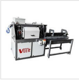
ECO Plain Wire Straightening Machine