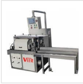
Plain Wire Straightening Machine