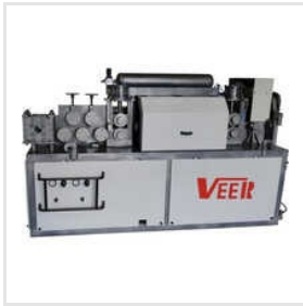
TMT Wire Straightening Machine Super-1200T