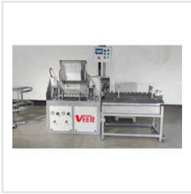
Automatic Wire Straightening And