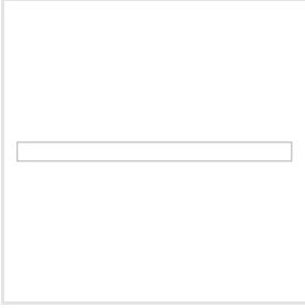
Plain Wire Straightening Machine