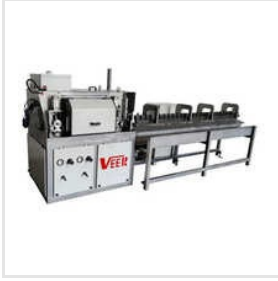
12 MM Wire Straightening And