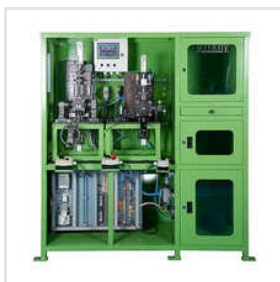
Gear Box Housing Shim Selection