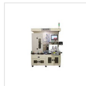
TC Main Shaft Shimming Gauge