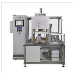
Automatic Advance Gauging System