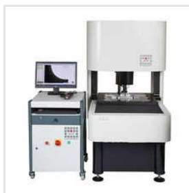
Automatic Multisensor CMM