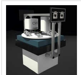
Automatic Defect Detection System