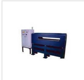
Profilometer For Checking Tyre Tread