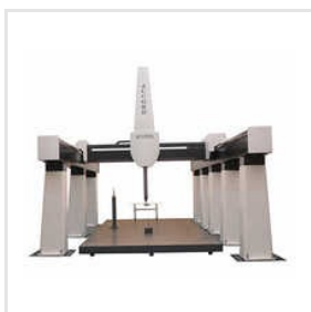
High Precision Gantry Type CMM