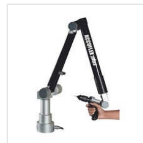
Automatic Portable CMM