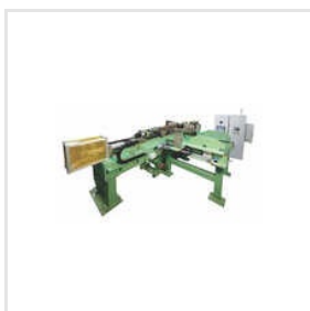
Wheel Axle Auto Gauging System