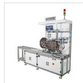
Auto Gauging Machine