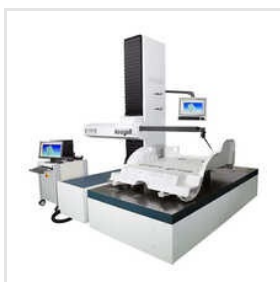
High Precision Horizontal Type CMM