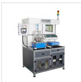
Connecting Rod Checking Fixture