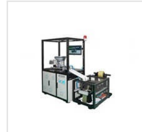
Auto Gauging Sorting And Packing Systems