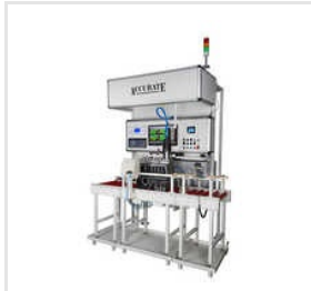
Cylinder Block Liner Bore Measuring