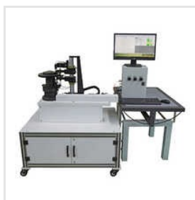
Brake Disc Auto Gauging System