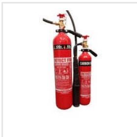
CO2 Fire Extinguisher