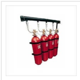
Detect Fire Extinguishing Systems