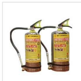
KITCHEN FIRE EXTINGUISHER