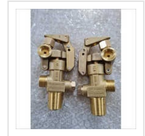
Co2 VTI Valve