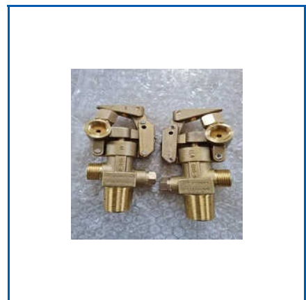
CO2 VTI VALVE