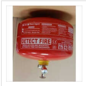
Modular Type ABC Fire Extinguisher