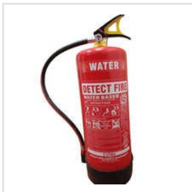
Water (Co2) Fire Extinguisher