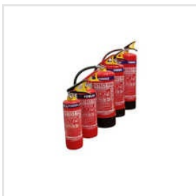
ABC Dry Powder Fire Extinguisher