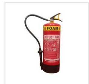
Mechanical Foam Fire Extinguisher