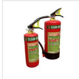
Clean Agent Fire Extinguisher