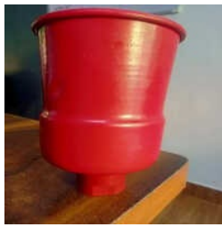
Co2 Flooding Nozzle Horn Type