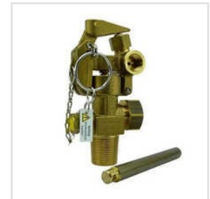
Co2 Valve For 45 Kg Cylinder