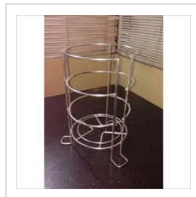
SS Fire Extinguisher Stand