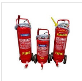
TROLLEY TYPE FIRE EXTINGUISHER