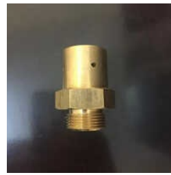
Co2 Flooding System Nozzle