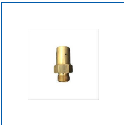
CO2 FLOODING SYSTEM

ABC Dry Powder Fire Extinguisher, Base Fire Suppression System, Blaze Cut Fire Suppression Hose, CNC Machine Fire Suppression System, CO2 Fire Extinguisher, CQRS Fire Suppression System, Ceiling Mounted Fire Extinguisher (Modular), Clean Agent Fire Extinguisher, Co2 Flooding Nozzle Horn Type, Co2 Flooding System, Co2 Flooding System Nozzle, Co2 VTI Valve, Co2 Valve for 45 kg Cylinder, Detect Fire Extinguishing Systems, FM 200 Fire Suppression System, etc.