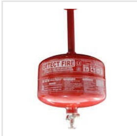
Ceiling Mounted Fire Extinguisher (Modular)