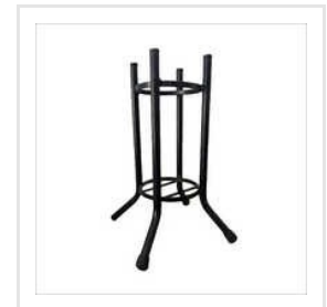
MS Fire Extinguisher Stand