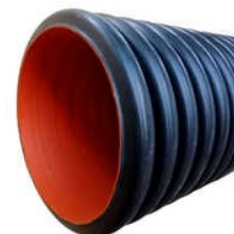
Double Wall Corrugated Pipe