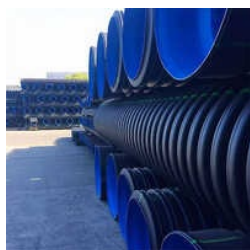
NEXT GENERATION DWC PIPE

100 MM SN4 DWC Pipe, 100 MM SN8 DWC Pipe, 1000 MM SN4 DWC Pipe, 110 MM Corrugated Plastic Pipe, 120 MM High-Density Polyethylene Corrugated Pipe, 12x12 Bottom FRP Chamber Cover, 12x12 Top FRP Chamber Cover, 175 MM Durable DWC Pipe, etc.