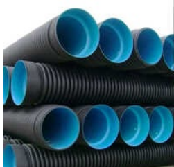
1000 MM SN4 DWC Pipe