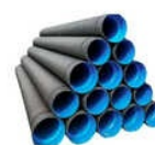
HDPE DOUBLE WALL CORRUGATED PIPE