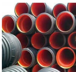
WEATHER RESISTANT DWC PIPE