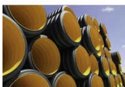
Double Wall Corrugated Dwc Pipe