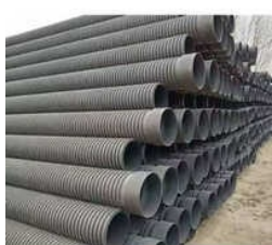
120 MM High-Density Polyethylene