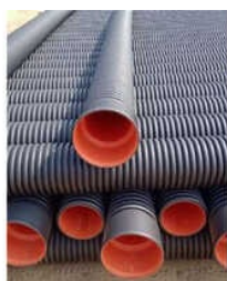
100 MM SN4 DWC Pipe