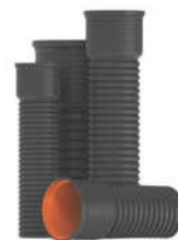
175 MM Durable DWC Pipe