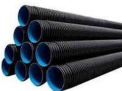
Dual Wall Corrugated Pipe