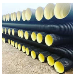
Impact Resistant DWC Pipe