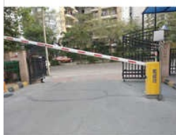
Yellow And Orange Mild Steel Faac Boom