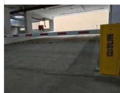
Stainless Steel Italy Automatic Boom