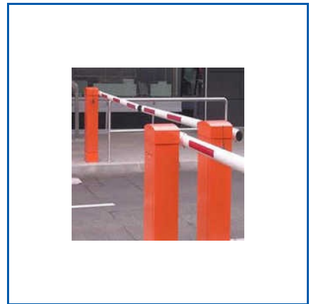
PARKING BOOM BARRIERS