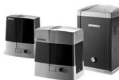
Electric Sliding Gates Motor