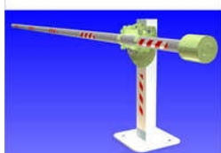
Manual Type Boom Barrier