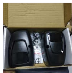
BTA Black Boom Barrier Photocell For Parking