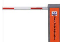
Toll High Speed Boom Barrier