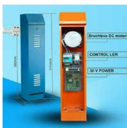
Brushless DC Boom Barrier