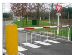
Automatic Fencing Boom Barrier