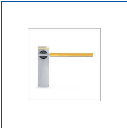
APARTMENT AUTOMATIC BOOM BARRIER

12-24volt Infrared Sensor For Security Barrier, Access Controller Reader, Aluminium Fabrication Work & Services, Aluminum Security Gate, Apartment Automatic Boom Barrier, Arms Type Swing Gate, Articulated Sliding Gates, Attendance System, etc.