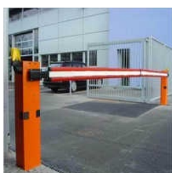
Automatic Boom Barrier Installation