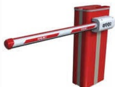
FAAC Automatic Barrier