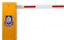
Electromechanical Boom Barrier