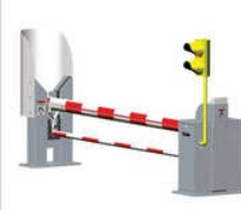
Faac Iron Anti Crash Barrier