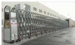
Articulated Sliding Gates