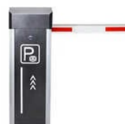
Grey Boom Barrier