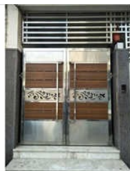
Home Gate Automation