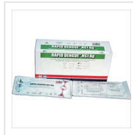
NS1 AG Rapid Dengue Kit