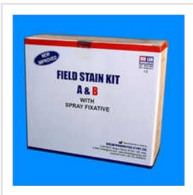
Field Stain A & B Test Kit