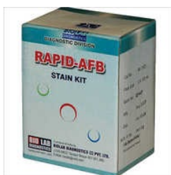
RAPID AFB STAIN KIT

22 Percent Bovine Serum Albumin, Albumin (Bcg Method Liquidsat), Albumin Glucose Reagent, Alkaline Phosphatase, Amylase (Cnpg3) (Liquistat), Anti A1 Lectin, Anti Human Globulin (Coomb's), Aso Turbilatex (Quantitative), Bilirubin (Liquistat), Bioclean (Neutral Detergent For Lab Ware), Biofix Spray, Biofix Spray Microanatomy Spray Fixative, Blood Grouping Regent Anti - D, CK NAC (IFCC), CSF Protein, etc.