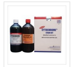
Cytochrome Stain Kit