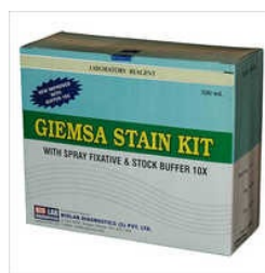
GIEMSA STAIN KIT