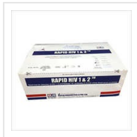
Rapid HIV 1 And 2 Triline Test Kit