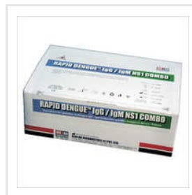
Rapid Dengue Combo Test Kit (IgG/IgM + NS1)