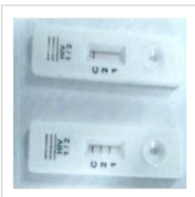
Rapid HIV TRI Line Test Card