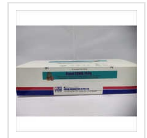
Rapid Covid-19 Antigen Test Kit