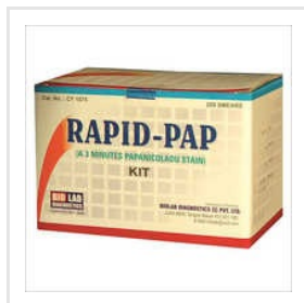
Rapid Pap Stain Kit