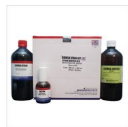
GIEMSA STAIN KIT