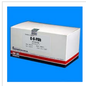
G-6PDh (Screening And Quantitative UV)