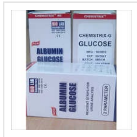
Albumin Glucose Reagent