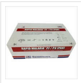
Rapid Malaria PF/PV Antigen Test Kit