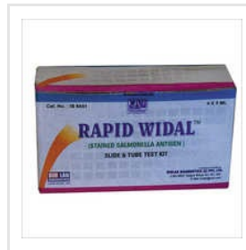
Rapid Widal Test Kit