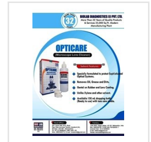
OPTICARE – MICROSCOPE LENS