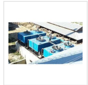
Induced Draft Cooling Tower