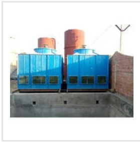
FRP Square Type Cooling Tower