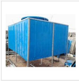
Water Cooling Tower