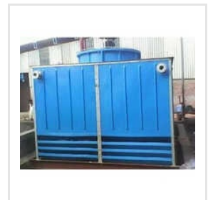
FRP Cooling Tower