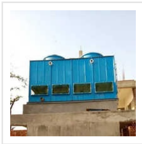
Industrial FRP Cooling Tower