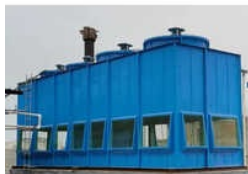
INDUSTRIAL FRP COOLING TOWER

Air Cooled Chillers, Air Handling Unit Panel, Aluminium Sprinklers for Cooling tower, Bottle Shape Cooling Tower, Driven Type Assembly Direct Fan, FRP Cooling Tower, FRP Glass Cooling Tower, FRP Induced Draft Cooling Tower, FRP Square Type Cooling Tower, Fan Less Cooling Tower, Forced Draft Cooling Tower, Induced Draft Cooling Tower, Industrial Air Washer System, Industrial Cooling Tower, Industrial Ducting Services, etc.