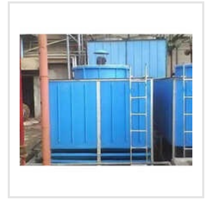
Forced Draft Cooling Tower