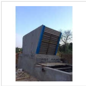
Fan Less Cooling Tower