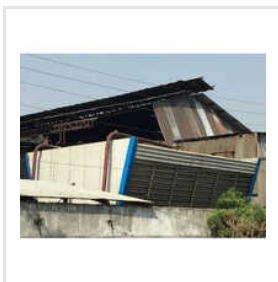
Wooden Cross Flow Cooling Towers