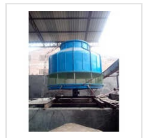
Bottle Shape Cooling Tower