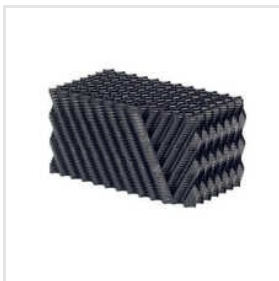
Modular PVC Honeycomb Fills