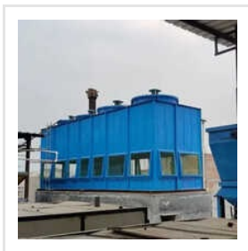
Industrial Cooling Tower