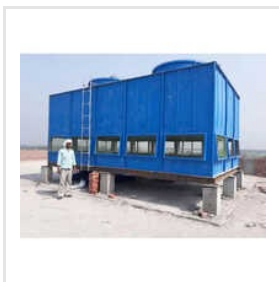
Industrial Induced Draft Cooling Tower