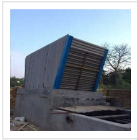
Wooden Cooling Towers