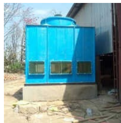
FRP GLASS COOLING TOWER