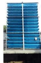
NATURAL DRAFT COOLING TOWER