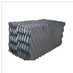
PVC Cooling Tower Fills