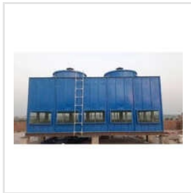
FRP Induced Draft Cooling Tower