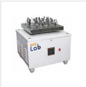
NYC-ROS-01 Vertical Type Laboratory