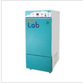
NYC-HSC-01 Humidity Chamber