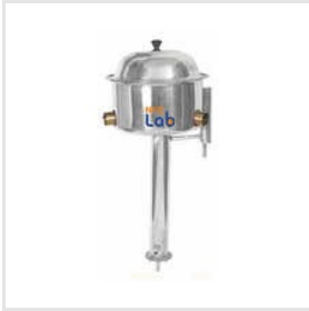
NYC-WDU-01 Water Distillation Unit