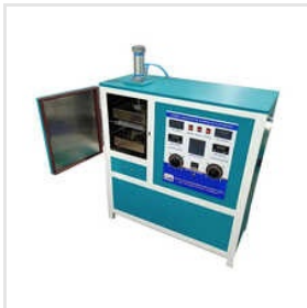
Two Slab Guarded Hot Plate Apparatus