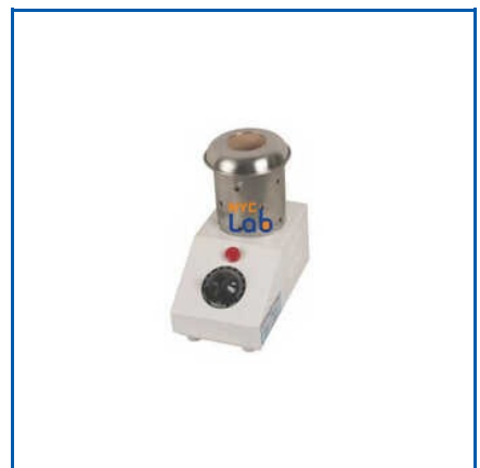
NYC-BNB-01 ELECTRIC BUNSEN BURNER