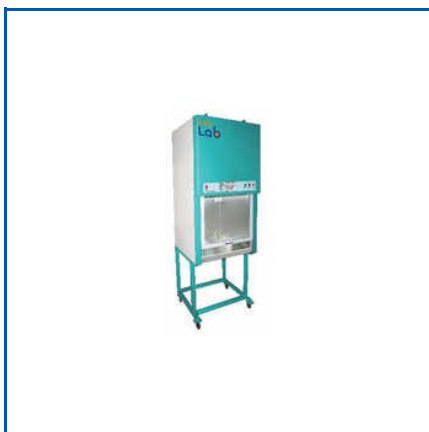
NYC-VLF-03 VERTICAL LAMINAR AIR FLOW CABINET

1 R Balance, Abel Flash Point Apparatus, Accelerated Curing Tank, Aggregate Crushing Value Apparatus, Analytical Balance, Aniline Point Apparatus, Asphalt Penetrometer, Auto Clave, Automatic Compression Testing Machine, Automatic Marshall Compactor, BOD Incubator, Bacteriological Incubator, Benkelman Beam Apparatus, Biological Microscope, Bitumen Extractor, etc.