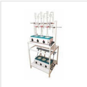
NYC-KDD-01 Kjeldahl Digestion And