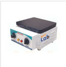
NYC-HTP-06 Rectangular Hot Plate