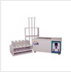
NYC-COD-01 COD Digester