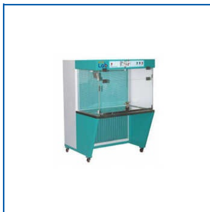
NYC-HLF-01 HORIZONTAL LAMINAR AIR FLOW CABINET