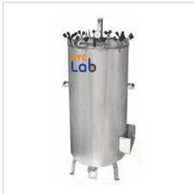
NYC-LAV-01 Vertical Type Laboratory