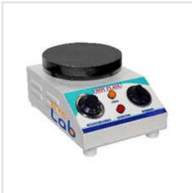
NYC-HTP-01 Round Hot Plate