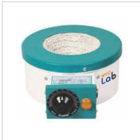
NYC-HTM-01 Heating Mantle