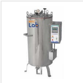
NYC-AUV-01 Fully Automatic Vertical