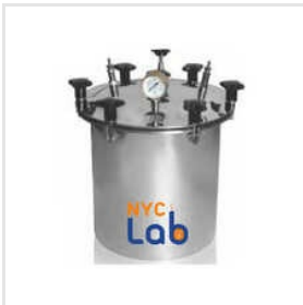
NYC-AUP-01 Portable Autoclave