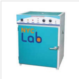
NYC-BAI-01 Memmert Type Bacteriological