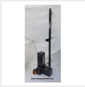
Badminton Pole Movable Black