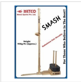
Metco Badminton Pole Movable Gold Color