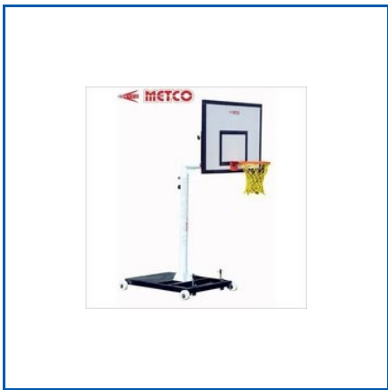
BASKETBALL POLE MOVABLE PRACTICE

45 Degree Back Extension Machine, 47 Inch Kho Kho Steel Pole, 5kg Rubber Dumbbells, 6 Inch Square Fixed Badminton Pole, Arm Wheel Exercise Machine, Artificial Landscaping Grass, Badminton Pole Fixed, Badminton Pole Movable, Badminton Pole Movable Black, Badminton Pole Movable Blue, Badminton Pole Removable, Basket Ball Dunking Ring, Basket Ball Round Ring, Basketball Pole Fixed, Basketball Pole Fixed 6 Inch Square Pipe, etc.