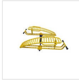
Metco Double Abdominal Board