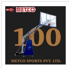
Basketball Pole Movable