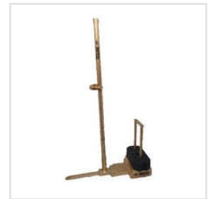
6 Inch Square Fixed Badminton Pole