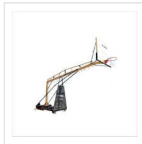
Movable MS Basketball Pole