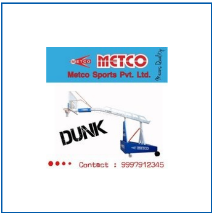
BASKETBALL POLE MOVABLE AND HEIGHT ADJUSTABLE