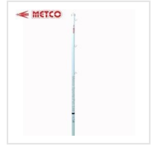
Badminton Pole Fixed