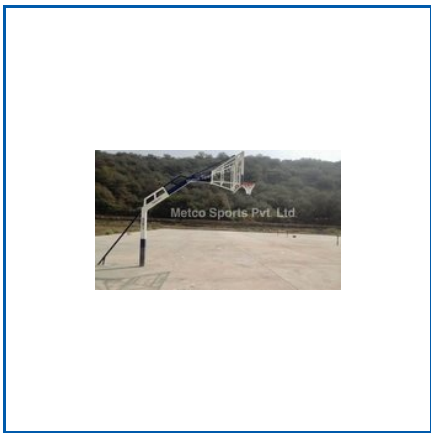
BASKETBALL POLE FIXED 6 INCH SQUARE PIPE