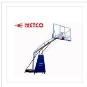
Movable Basketball Pole