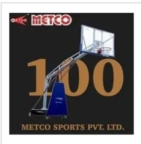
Movable Basketball Pole