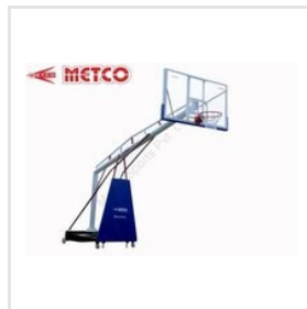
Movable Basketball Pole