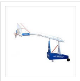
Movable And Height Adjustable Basketball