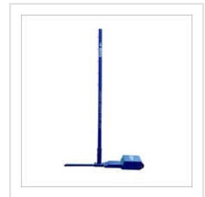
Outdoor Movable Badminton Pole