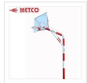
Basketball Pole Fixed