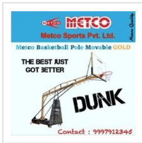
Movable Basketball Pole Gold - Black