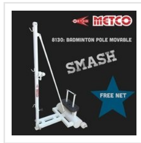
Badminton Pole Movable