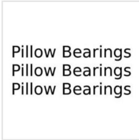
Conveyor Pillow Bearings