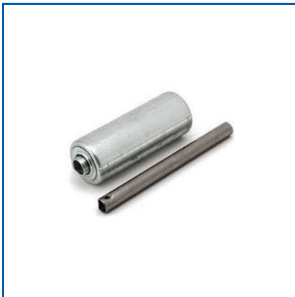
CONVEYOR MACHINERY PARTS

Conveyor Belts, Conveyor Drums, Conveyor Gear Box, Conveyor Loader, Conveyor Machinery Parts, Conveyor Pillow Bearings, Conveyor Roller, Friction Adjusting Conveyor Roller, Idler Roller Conveyor, Industrial Conveyor Belt, Material Handling Equipments, Roller Belt Conveyor, etc.