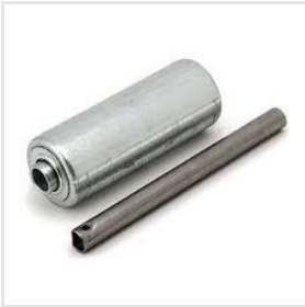
Conveyor Machinery Parts