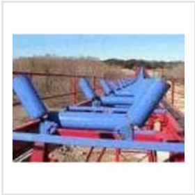
Friction Adjusting Conveyor Roller