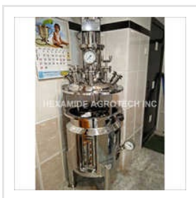
Stainless Steel Fermenter