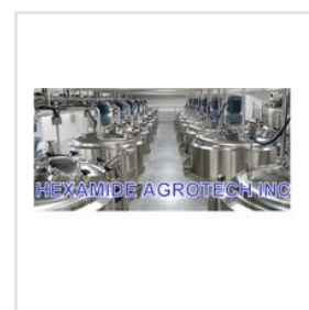
Industrial SS Fermenter