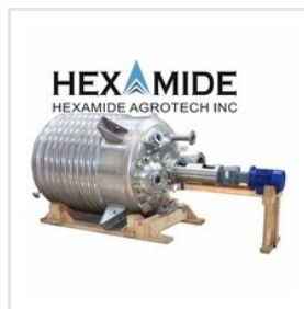
Industrial Chemical Reactors