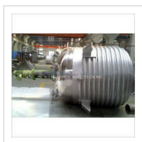
Industrial Limpet Reactor