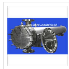
Industrial Heat Exchanger