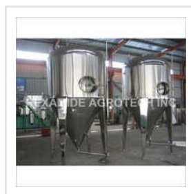
Industrial Herbal Extractor