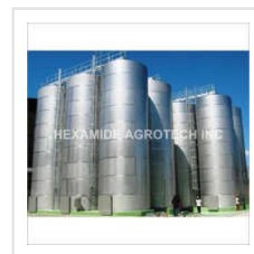
Industrial Chemical Storage Tank