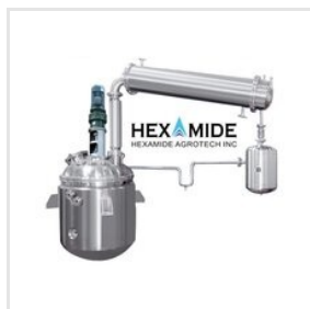
Industrial Resin Plant