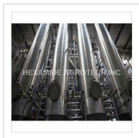
Industrial Distillation Plants