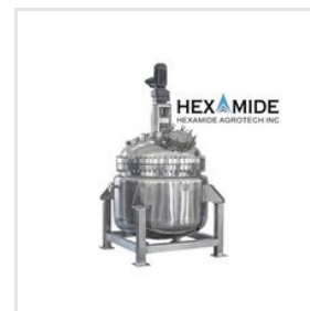
Stainless Steel Reactor