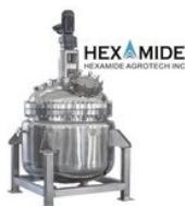
INDUSTRIAL CHEMICAL VESSELS

High Speed Dual Shaft Liquid Mixer, Industrial Chemical Reactors, Industrial Chemical Storage Tank, Industrial Chemical Vessels, Industrial Distillation Assembly, Industrial Distillation Plants, Industrial Heat Exchanger, Industrial Herbal Extractor, Industrial Limpet Reactor, Industrial Resin Plant, Industrial SS Chemical Receivers, Industrial SS Fermenter, Industrial Vertical Autoclave, Mixing Vessels, Powder Blender, etc.