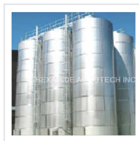
Stainless Steel Storage Tanks