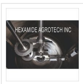
High Speed Dual Shaft Liquid Mixer