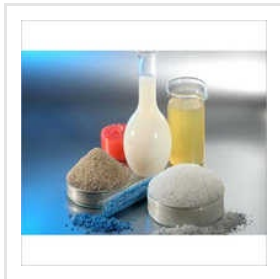
Industrial Wire Drawing Soaps And