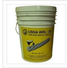
USHA WRL - 60 (Wire Rope Service)