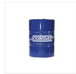
INDUSTRIAL FIRE RESISTANT HYDRAULIC FLUIDS