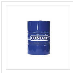
Industrial Fire Resistant Hydraulic