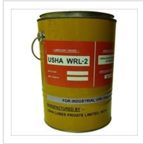
Industrial Wire-Rope Lubricant