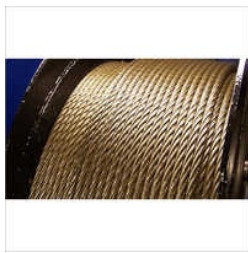
USHA BC - 01

4kg Industrial Wire-Rope Lubricant, Industrial Fire Resistant Hydraulic Fluids, Industrial Wire Drawing Soaps And Lubricants -Greases, Industrial Wire-Rope Lubricant, USHA BC - 01, USHA WRL - 60 (Wire Rope Service Lubricant), WIRELOCK - Wire Rope Cold Socketing Compound, etc.