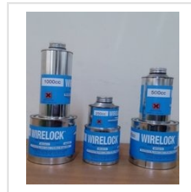
WIRELOCK - Wire Rope Cold Socketing