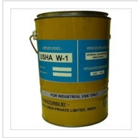
Industrial Wire-Rope Lubricant