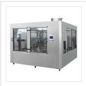
Automatic Bottle Filling Machine