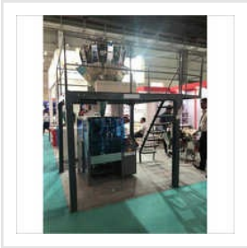
FFS Pouch Packing Machine With Multi