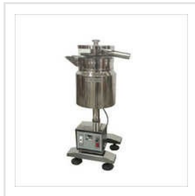
Pharmaceutical Deduster Metal