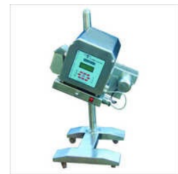
PHARMA METAL DETECTOR MACHINE