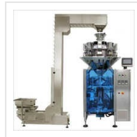
FFS Pouch Packing Machine