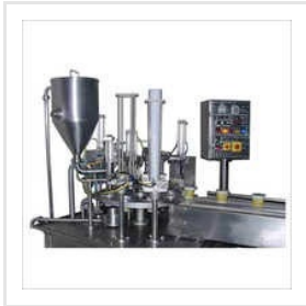
Mineral Water Filling Machine