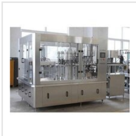
Juice Filling Machine