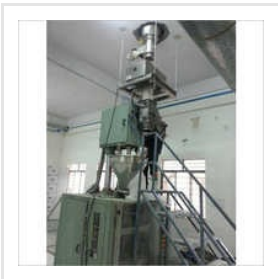
Industrial Gravity Feed Metal Detector