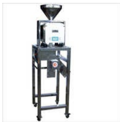
GRAVITY FEED METAL DETECTOR MACHINE

Automatic Bottle Filling Machine, Automatic Can Filling and Seaming Machine, Bags Metal Detector Machine, Bakery Metal Detector Machine, Can Filling Machine, Deduster Metal Detector Machine, Electric Pharma Metal Detector Machine, FFS Pouch Packing Machine, FFS Pouch Packing Machine With Multi Head, Food Metal Detector Machine, Fully Automatic Powder Filling Machine, etc.