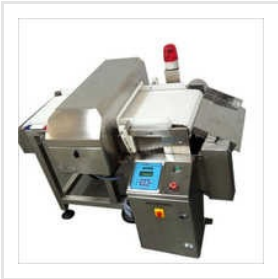
Bakery Metal Detector Machine