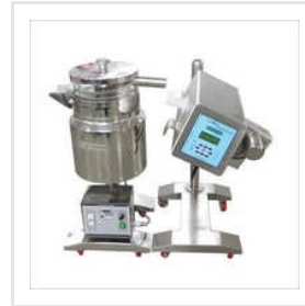
Electric Pharma Metal Detector Machine