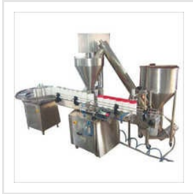
Fully Automatic Powder Filling Machine