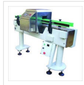
Food Metal Detector Machine