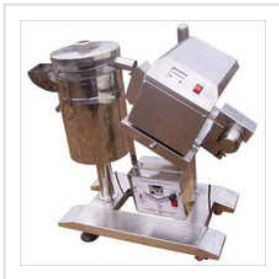
Deduster Metal Detector Machine