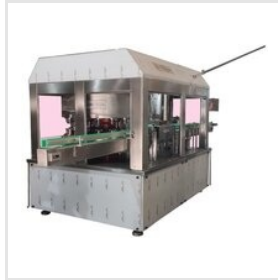
Automatic Can Filling And Seaming Machine