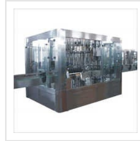
Industrial Bottle Filling Machine