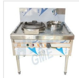
Chinese Single Burner Gas Stove With Washer