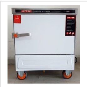
Idli Steamer Machine