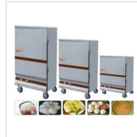
Commercial Rice Steamer