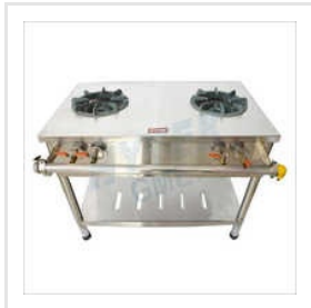
Double Round Burner Gas Stove