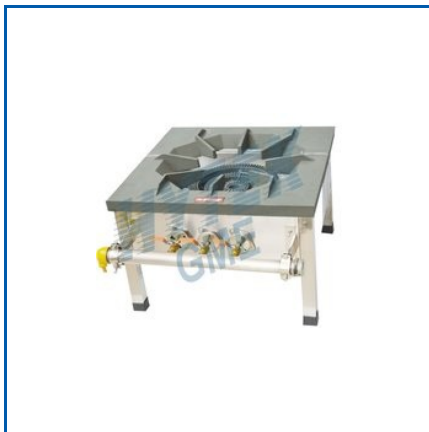
SINGLE GAS BURNER IRON TOP PLATE

Automatic Momo Production Machine, Automatic Momo Sheet Cutting/Momo Wrapper Making, Automatic Momos Machine, Automatic Round Shape Momo Making Machine, Automatic Tilting Fryer (Batch Type), Automatic Vegetable Cube Cutting Machine/Vegetable Dicer/Vegetable Dicing Machine, etc.