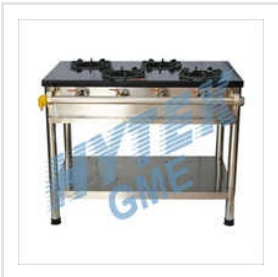
Iron Top Plate Four Gas Burner