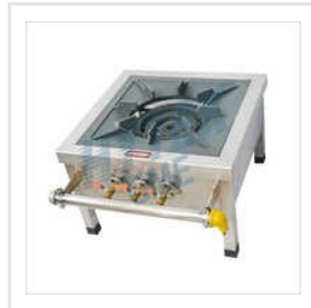
SS Top Frame Single Gas Burner