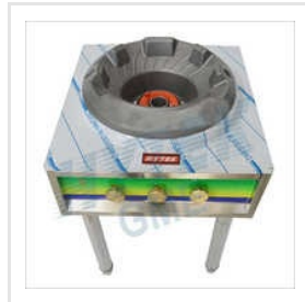
SS Top Frame Single Chinese Gas Burner