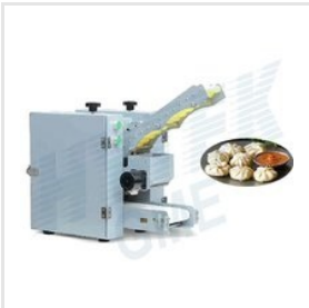
Momo Sheet Cutting Machine