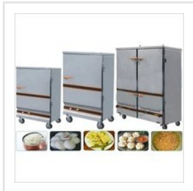
Commercial Rice Steamer