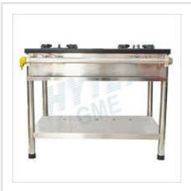
Iron Top Plate Double Burner Gas Stove