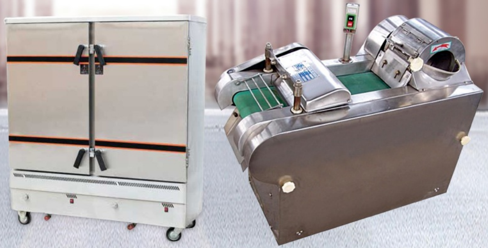
Multipurpose Food Steamer Vegetable cutting and slicing machine

Automatic Momo Production Machine, Automatic Momo Sheet Cutting/Momo Wrapper Making, Automatic Momos Machine, Automatic Round Shape Momo Making Machine, Automatic Tilting Fryer (Batch Type), Automatic Vegetable Cube Cutting Machine/Vegetable Dicer/Vegetable Dicing Machine, etc.