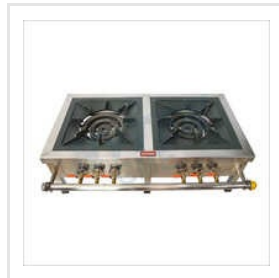
SS Top Frame Double Gas Burner