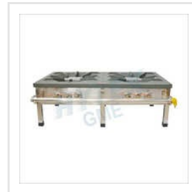
Iron Top Plate Double Gas Burner