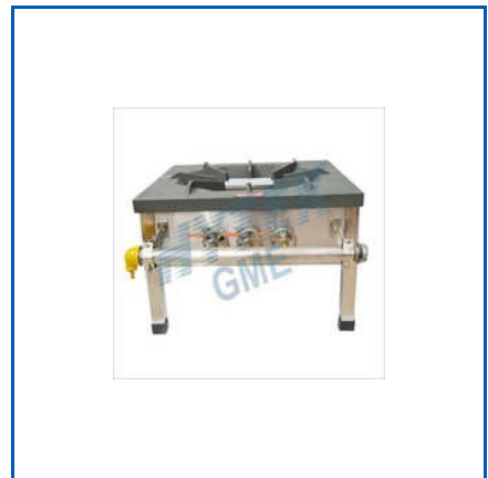
IRON TOP PLATE SINGLE GAS BURNER