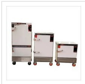
Idli Making Machine