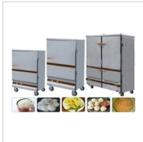
Commercial Rice Steamer