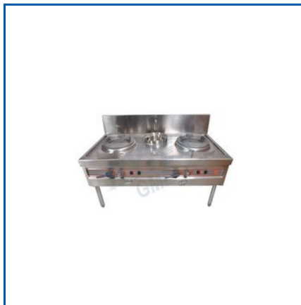
CHINESE BURNER WITH SINK