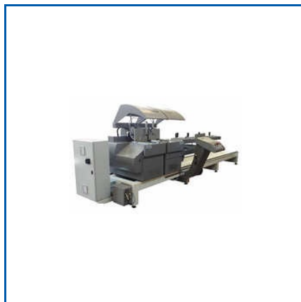
DOUBLE HEAD CUTTING SAW MACHINE