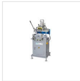
Industrial UPVC Machine