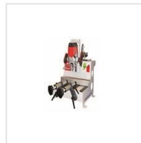
Industrial Copy Router Machine