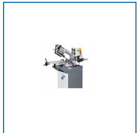
STEEL BAND CUTTING SAW MACHINE