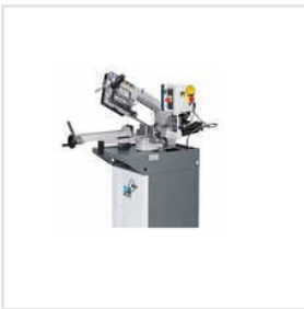
Steel Band Cutting Saw Machine