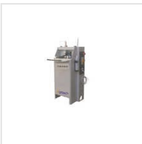
Industrial End Milling Machine