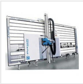
Italian Acp Processing Machine