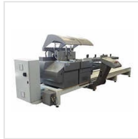
Double Head Cutting Saw Machine