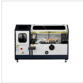
Notching Cutting Saw Machine