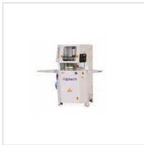
Industrial Corner Cleaning Machine