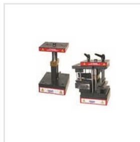
Industrial Punching Machine