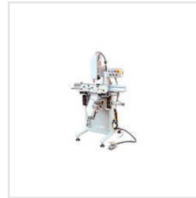
Industrial Drain Slot Saw Machine