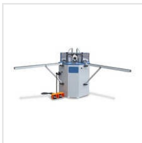
Industrial Crimping Machine