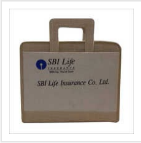
Jute Printed Conference Bag