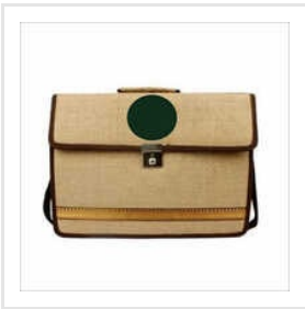
Jute Conference Laptop Bag