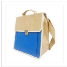
Jute Office Bag