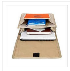
Jute Brown Document Folder