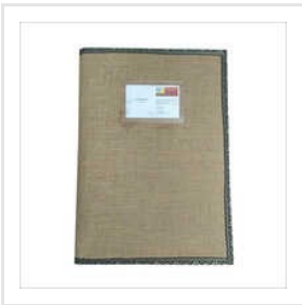
Jute File Folder