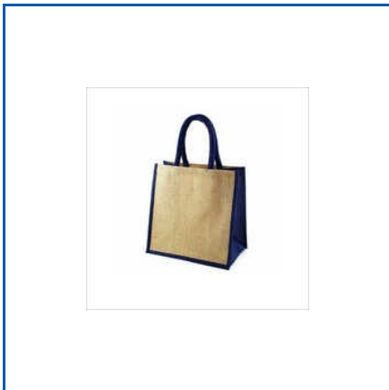
JUTE SHOPPING BAG

Designer Jute Bags, Jute Brown Backpack Bag, Jute Brown Color File Folder, Jute Brown Document Folder, Jute Brown Tray, Jute Conference Bag, Jute Conference Laptop Bag, Jute Designer File Folder, Jute Designer Pouches, Jute Document Folder, Jute Fancy Conference Bag, Jute Fancy Tray, Jute File Folder, Jute Office Bag, Jute Office Laptop Bag, etc.