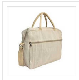
Jute Plain Laptop Bag