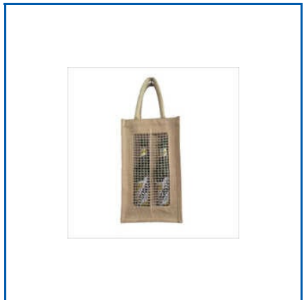
JUTE TWO BOTTLE BAG