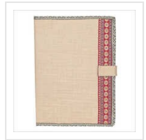
Jute Plain File Folder