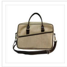
Jute Office Laptop Bag