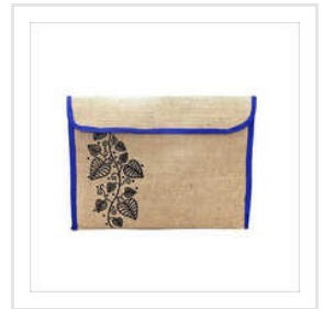
Jute Rectangular Envelope Folder