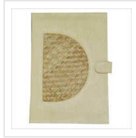
Jute Rectangular File Folder