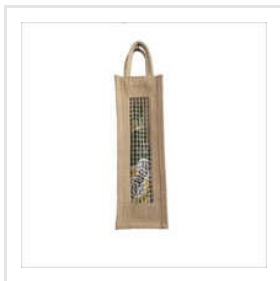
Jute Single Bottle Bag