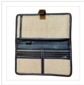
Jute Document Folder