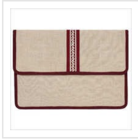
Jute Designer File Folder