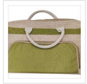
Jute Padded Compartment Laptop