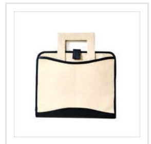
Jute Fancy Conference Bag