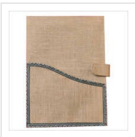
Jute Brown Color File Folder