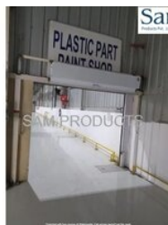
Powder Coated Air Curtains