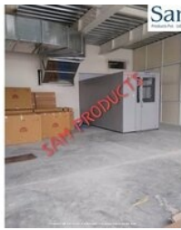
Stainless Steel Air Shower