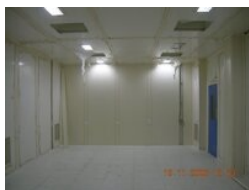
MODULAR CLEAN ROOM PANELS

Revolutionizing the market of Clean Room Products, Clean Room Supplies with an array of high quality Air Curtains, Cleanroom Air Shower, Air Showers, Pass Boxes, Clean Room Products and Air Cooling Systems.