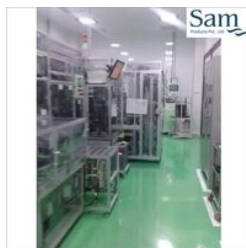
CLEAN ROOM SYSTEMS