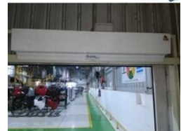
Door Air Curtain