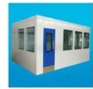
BSL II Clean Room