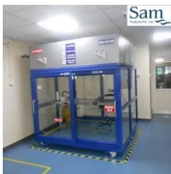
Modular Clean Room