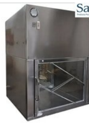
Mild Steel Pass Box