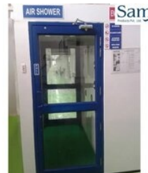
Cleanroom Air Shower