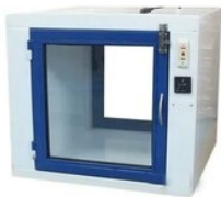
Clean Room Pass Box