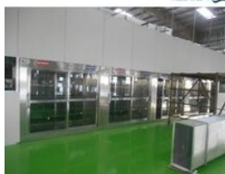
Dynamic Pass Box