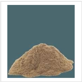
Chitrak Root Powder