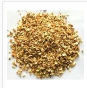
Cold Dried Orange Peel Flakes