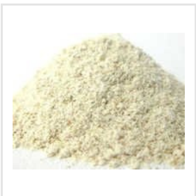
Safed Musli Powder