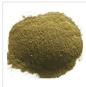
Betel Leaf Powder