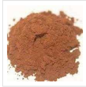
Ashok Bark Powder