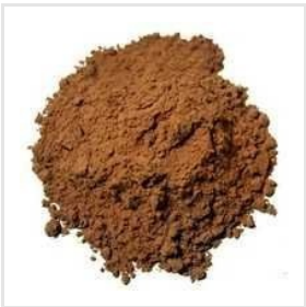
Arjun Bark Powder