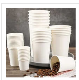
Rippled Paper Disposable Glasses