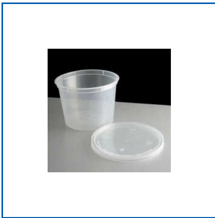
TRANSPARENT PLASTIC CONTAINER

5 Compartment Meal Tray With Lid, Clean Wrap Cling Film, Corrugated Cake Box, Corrugated Pizza Packaging Box, Disposable Aluminium Foil Containers, Hinged Disposable Container, Non Woven Carry Bag, Non Woven Packaging Bag, PP Woven Cut Carry Bag, Paper Carry Bags, Paper Drinking Straw, Paper Roll Warp, Pasty Container, Pet Hinged Lid Container, Plastic Band Straw, etc.