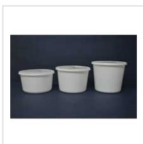
White Plastic Container