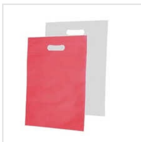
Non Woven Packaging Bag