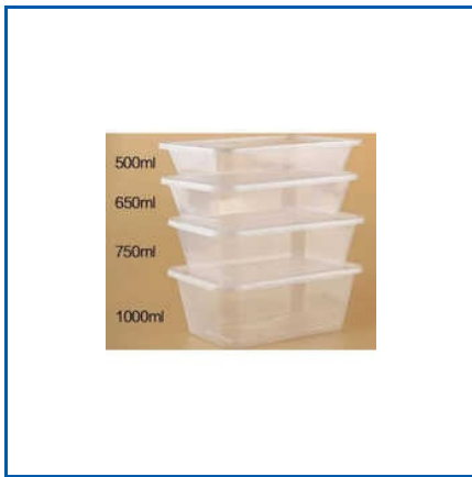
TRANSPARENT PLASTIC RECTANGLE CONTAINER