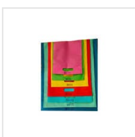
Non Woven Carry Bag