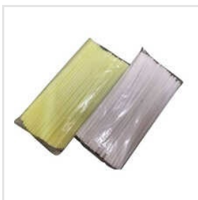
Plastic Band Straw