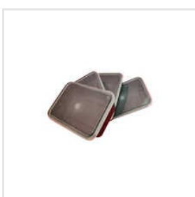
Rectangle Food Container Box