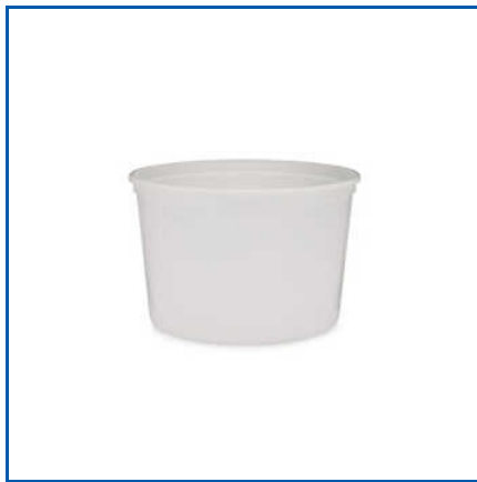
PLASTIC PACKAGING CONTAINER