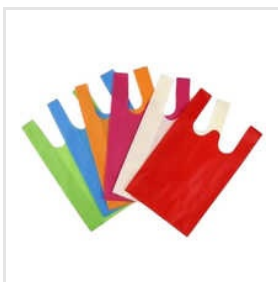
PP Woven Cut Carry Bag