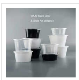
Plastic Food Storage Container