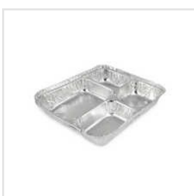
Disposable Aluminium Foil Containers