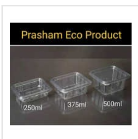
Hinged Disposable Container