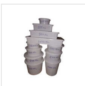
Plastic Food Storage Container