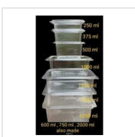
Transparent Pet Food Packaging Container