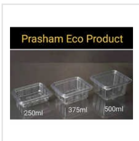
Pet Hinged Lid Container