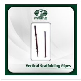
Vertical Scaffolding Pipes