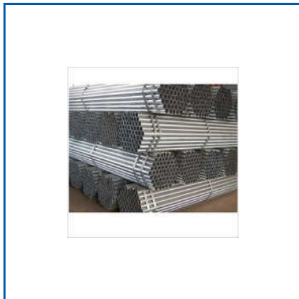
ALUMINIUM SCAFFOLD TUBE