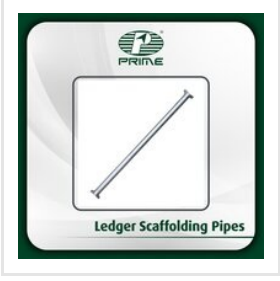
Ledger Scaffolding Pipes