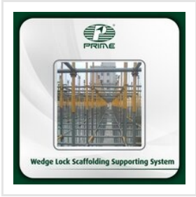
Wedge Lock Scaffolding System