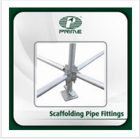
Scaffolding Pipe Fittings