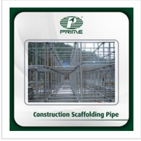
Construction Scaffolding Pipe