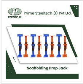
Scaffolding Props Jack