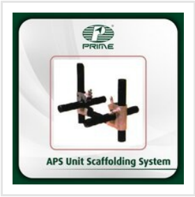
APS Unit Scaffolding System