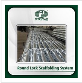
Round Lock Scaffolding System