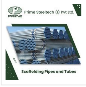
MS Scaffolding Pipes And Tubes