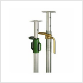
Tubular Scaffolding Fittings