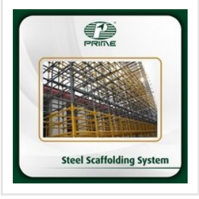
Steel Scaffolding System