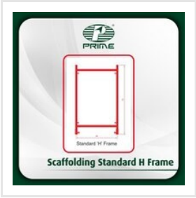
H Frame Scaffolding