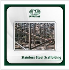
Stainless Steel Scaffolding