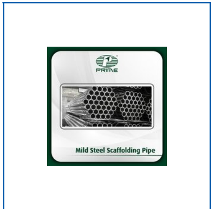
MILD STEEL SCAFFOLDING PIPE