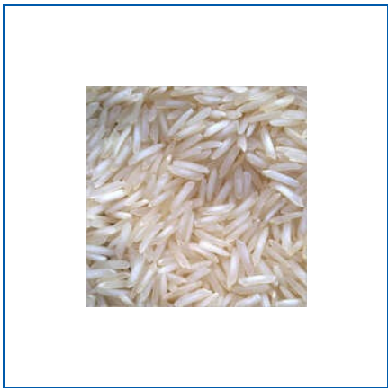
LONG WHITE RICE