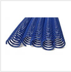
Plastic Spiral Binding Coil