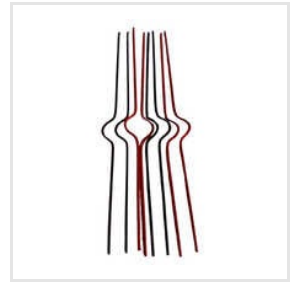
Wall Calendar Hanger