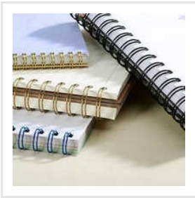
Notebook Spiral Binding Wire