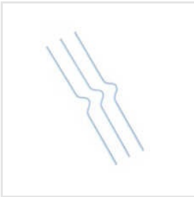
Calendar Hanger Steel Wire