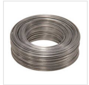
Galvanized Iron Cutting Wire