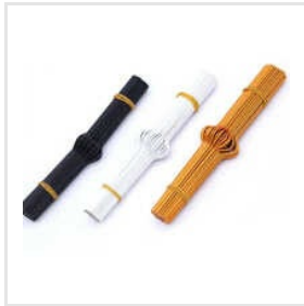
Nylon Coated Calendar Hanger