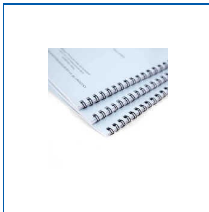
RING BINDING WIRE