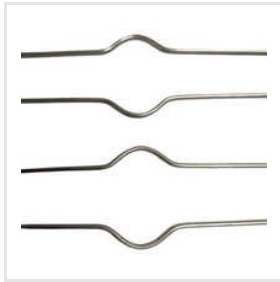
GI Wire Calendar Hanger