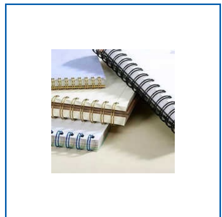
NOTEBOOK SPIRAL BINDING WIRE