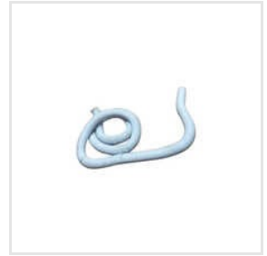
Plastic Book Binding Wire