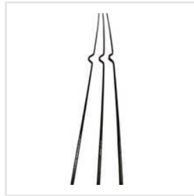
Metal Calendar Hanger Wire