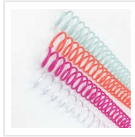
PVC Spiral Binding Wire