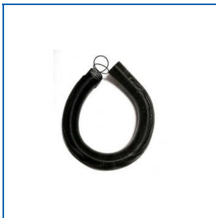
NYLON COATED SPIRAL BINDING WIRE

Calendar Hanger Steel Wire, GI Wire Calendar Hanger, Galvanized Iron Cutting Wire, Metal Calendar Hanger Wire, Notebook Spiral Binding Wire, Nylon Coated Calendar Hanger, Nylon Coated Spiral Binding Wire, PVC Spiral Binding Wire, Plastic Book Binding Wire, Plastic Book Spiral Coil, Plastic Spiral Binding Coil, Ring Binding Wire, Straight Galvanized Iron Cutting Wire, Wall Calendar Hanger, etc.