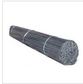
Straight Galvanized Iron Cutting Wire