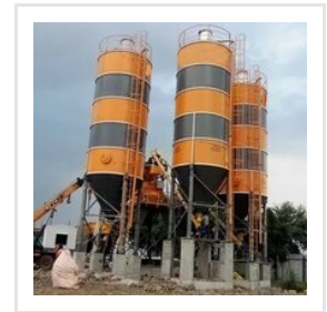
RMC Batch Storage Silo