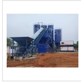
Industrial RMC Plant