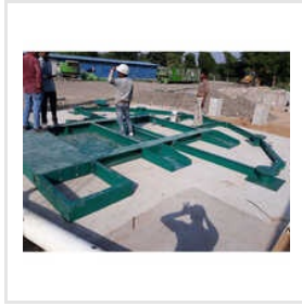
Industrial Skid Fabrication