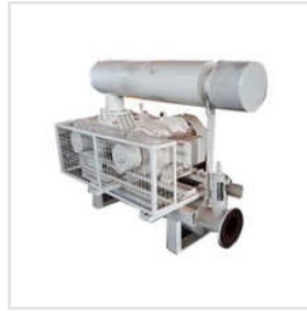
Paint Coated Cement Feeding Pump