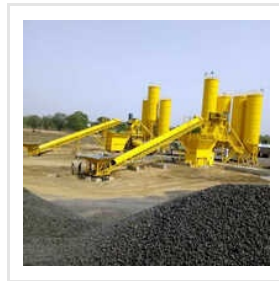
Batching Plant Radial Conveyor