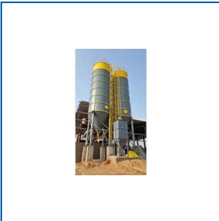
WELDED GGBS SILO

10 TPH to 350 TPH Rotary Chute Type Belt Conveyor, 10 TPH to 500 TPH Radial Belt Conveyor, 25 TPH Jumbo Bag Feeding System, 25 TPH to 35 TPH Bulker Unloading Pump, 50 MT to 500 MT Horizontal Silo, Aggregate Feeding Belt Conveyor, Automatic RMC Plant, Batching Plant Radial Conveyor, Bulker Unloading Pump, etc.