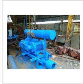
Twin Lobe Cement Feeding Pump