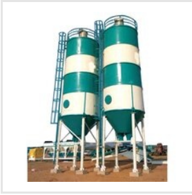
Material Storage Silo