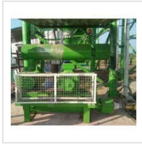
Cement Feeding Rotary Blower