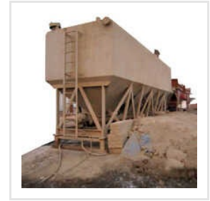
50 MT To 500 MT Horizontal Silo