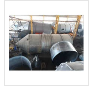
Heavy Structure Fabrication Work