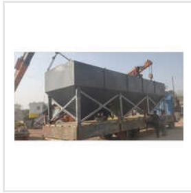
Industrial Horizontal Silo