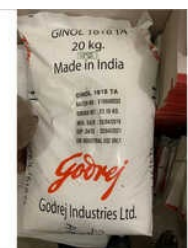
Ginol 16 18 TA