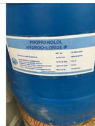
Propranolol Hydrochloride IP