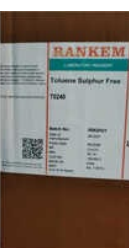
Toluene Sulphur Free