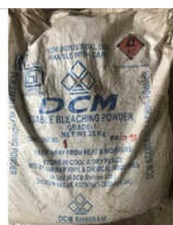
Stable Bleaching Powder