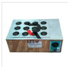
REEW Open Dying Pot