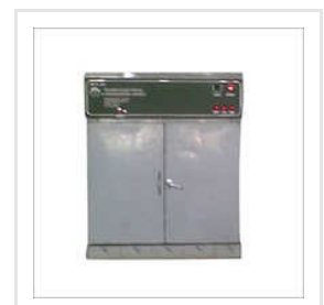
Clay Moulding Oven