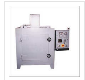
Low Tempering Oven