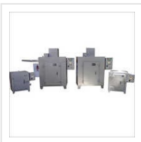
Flux Baking Oven