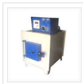
Lab Muffle Furnace