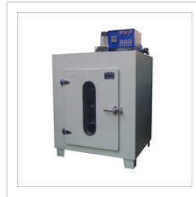
Post Curing Oven