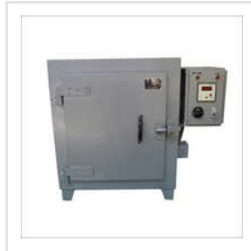
Electrode Baking Oven