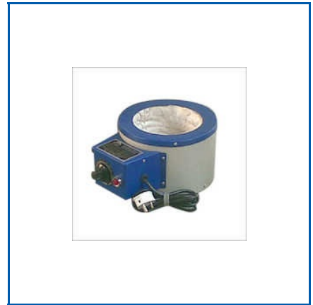
LAB HEATING MANTLES