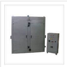
Core Drying Oven