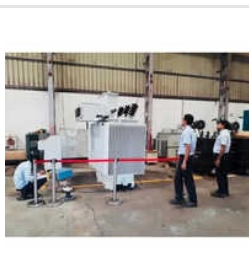
High Power Transformer