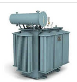
200 Kva Three Phase Transformer