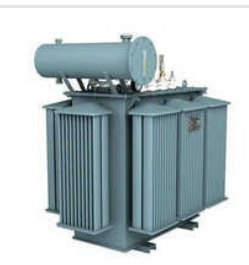
315 KVA Distribution Transformer