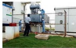
Electrical Transformer AMC Services