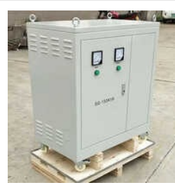
Three Phase Auto Transformer