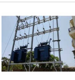
Pole Mounted Transformer