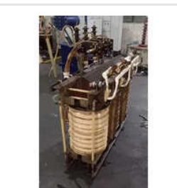
Transformer Rewinding Services