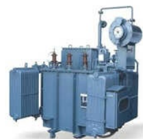
OIL COOLED POWER TRANSFORMER