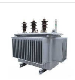
22 KV Distribution Transformer