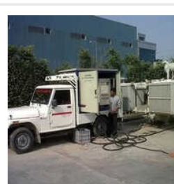
Transformer Oil Filter Services