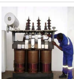
Industrial Transformer Repairing Services