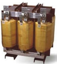
COPPER WOUND TRANSFORMER

200 kva Three Phase Transformer, 22 KV Distribution Transformer, 315 KVA Distribution Transformer, Automatic Furnace Transformer, Compact Size Wind Transformer, Copper Wound Transformer, Electrical Distribution Transformer, Electrical Transformer AMC Services, High Power Transformer, Industrial Power Transformer Testing Services, etc.