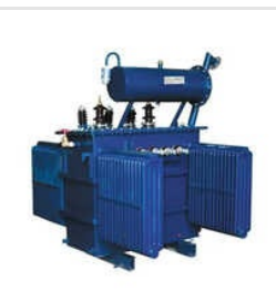
Three Phase Oil Filled Transformer