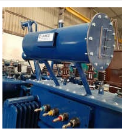
Electrical Distribution Transformer