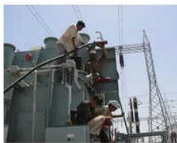
Transformer Maintenance Services