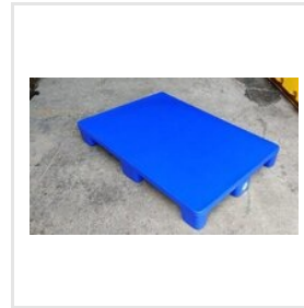
Material Movement Pallets