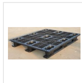
HDPE Two Way Plastic Pallets