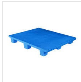
Drive In Rack Pallets