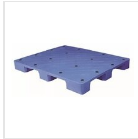
HDPE Storage Plastic Pallets