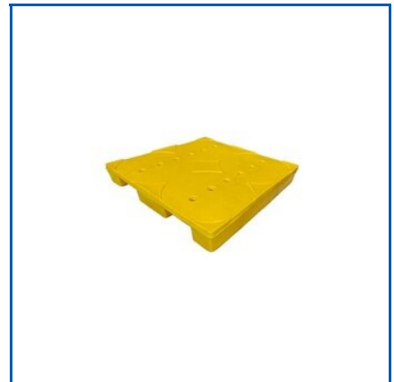
FOUR DRUM PALLETS