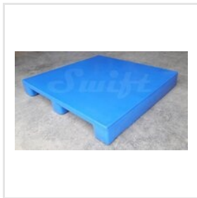
Plain Top Plastic Pallet