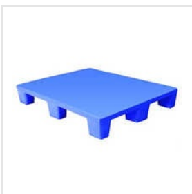
4 Way Entry Non Reversible Pallet