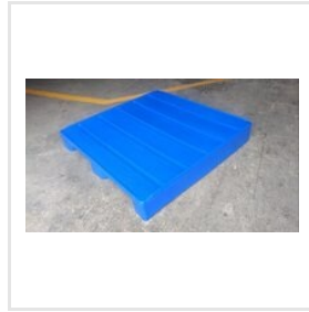
Anti Static 2 Way Plastic Pallets