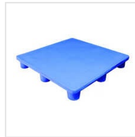
4 Way Entry Non Reversible Pallets H-