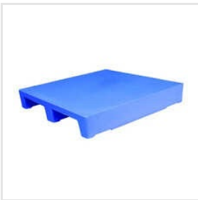
2 Way Entry Non Reversible Pallets R-