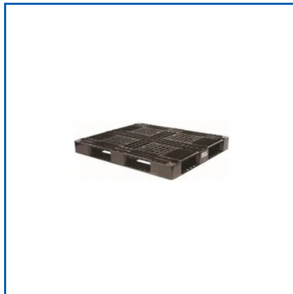
EXPORT DOUBLE DECK PALLET