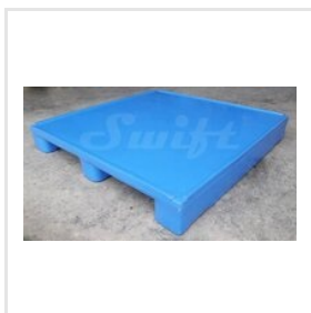
Medium Duty Plastic Pallets