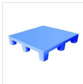
4 Way Entry Non Reversible Heavy Duty