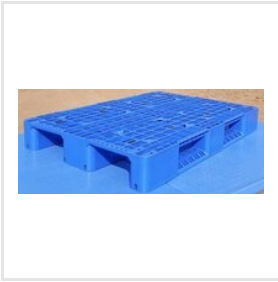
Injection Molded 4 Way Plastic Pallets