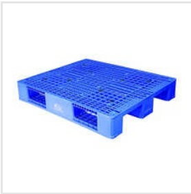
HDPE Rackable Plastic Pallets