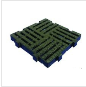
PE Floor Pallet