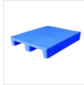
2 Way Entry Non Reversible Pallets P-