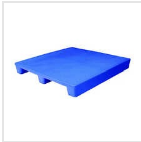
2 Way Entry Non Reversible Pallets H-