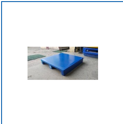
2 WAY ENTRY PLASTIC PALLETS

2 Drum Spill Containment Non Movable Pallets, 2 Drum Spill Pallet, 2 Way Entry Non Reversible Pallets, 2 Way Entry Rackable Plastic Pallets, 4 Drum Spill Containment Movable Pallets, 4 Drum Spill Containment Non Movable Pallets, 4 Way Entry Non Reversible Pallets, etc.