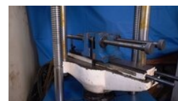
BEND TESTING SERVICES