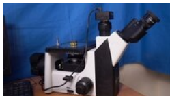
Metallurgical Testing Service