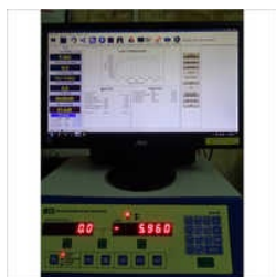
LOAD CELL ATTACHEMENT

Bend Testing Services, Compression Testing Services, Corrosion Testing Services, Failure Analysis, Hardness Testing Services, IGC Testing Service, Impact Testing Machine, Impact Testing Service, Impact Testing Services, Industrial Tensile Testing Service, Inter Granular Corrosion Testings, Intergranular Corrosion Testing Services, Load Cell Attachment, Mechanical Testing Lab Services, Metallurgical Test, etc.