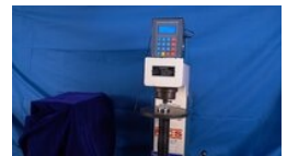
Rockwell Hardness Testing