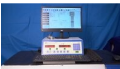
Industrial Tensile Testing Service