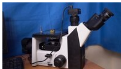
Metallurgical Testing Services