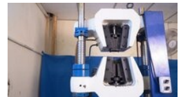
Tensile Testing Service