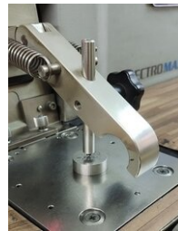
Spectro Testing Service