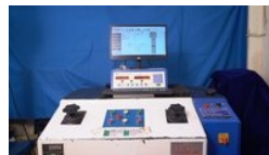
Mechanical Testing Lab Services