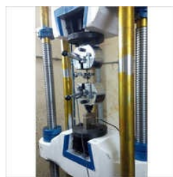
Universal Testing Machine