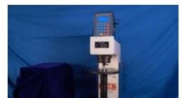
Rockwell Cum Brinel Hardness Tester