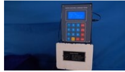
Hardness Testing Services