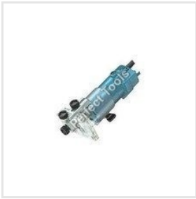
Hand Trimmer Machine