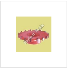
Finger Face Cutter