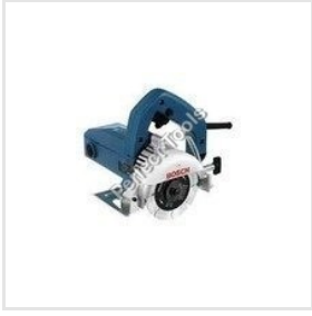
Circular Saw Machine