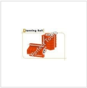
Planner Roll Cutter