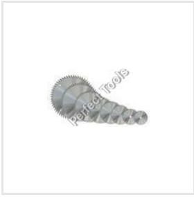
Circular Saw Blades