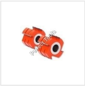
Floor Jointing Cutter