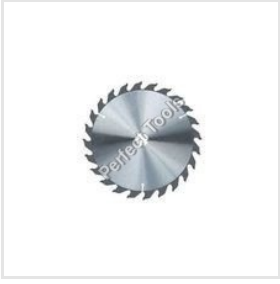
Industrial Saw Blades