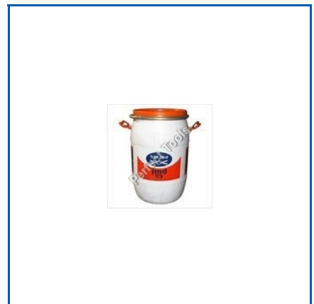
WATERPROOF WOOD ADHESIVE