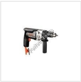
Endico Drill Machine