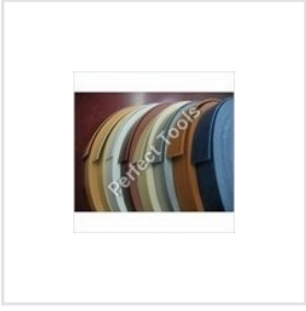
PVC Edge Bending Tapes