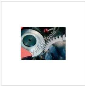
Saw And Tooling Sharpening