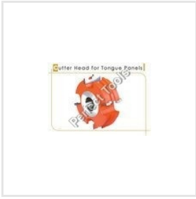
Tongue Panels Cutter Head