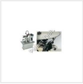
Saw Sharpening Machines