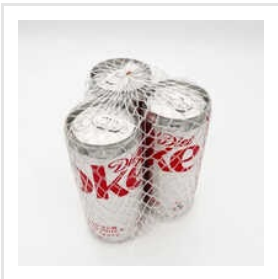
Cold Drinks Packing Net Bags