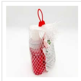
Air Freshener Packing Net Bags