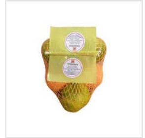
Packaging Net With Label