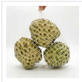
Custard Apple Packing Bag