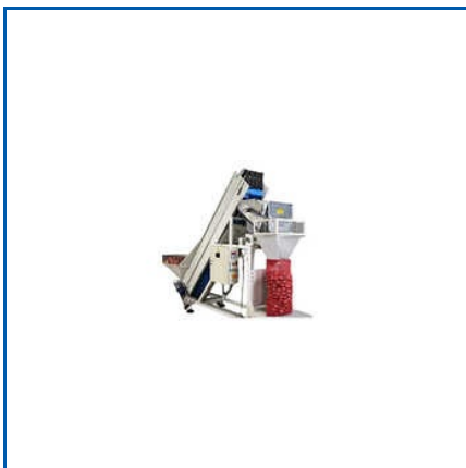
WEIGHER PACKAGING MACHINE

1KG Capacity Net Bags For Vegetables, 2 kg Capacity Net Bags For Vegetables, 5 Kg Vegetable Mesh Bag, 5 kg Raschel Mesh Bag, 5KG capacity Net Bags For Vegetables, Air Freshner Packing Net Bags, Beetroot Packing Bag, Biodegradable Packing Net, Biscuit Packing Net Bags, Capsicum Packing Bag, Chips Packing Net Bags, Cold Drinks Packing Net Bags, Combo Pack Net Bags, Combo Packaging, Compostable Fruit Net Bags, etc.