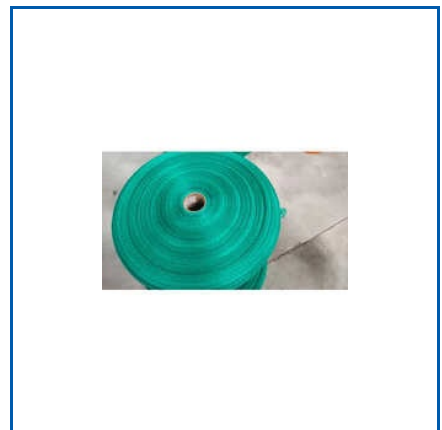
GREEN PACKAGING NET ROLLS