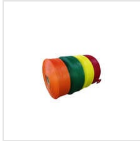
Tubular Packaging Net