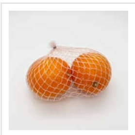
Orange Packing Bag