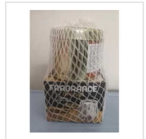
Pet Jar Bottles Packaging Net Bags