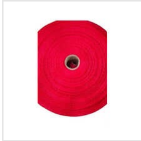
Red Packaging Net Rolls