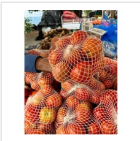
Compostable Natural Net Bags