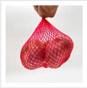
Red Packing Net With Clip