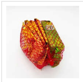
Snacks Packing Net Bags