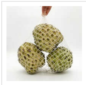
Compostable Fruit Net Bags