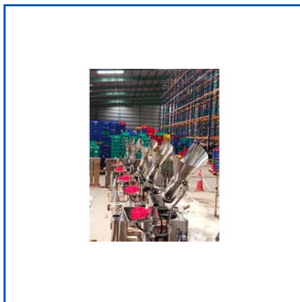
SEMI AUTOMATIC CLIPPING PACKAGING MACHINE