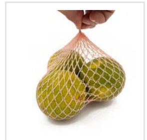
Mosambi Packing Bag