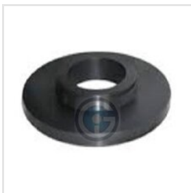
Pp Black Collar Threaded Flange