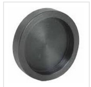
Hdpe End Cap