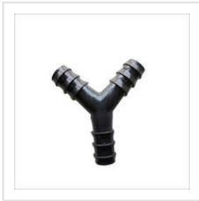
Drip Y Tee