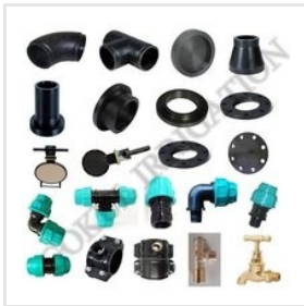
Hdpe Pipe Fittings