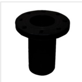
HDPE Spigot Tail Piece Flange