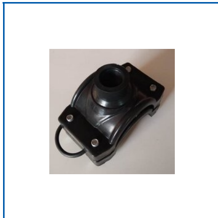
HDPE SERVICE SADDLE