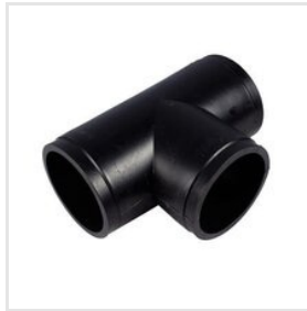
Hdpe Pipe Tee