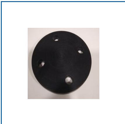
HDPE BLIND FLANGE

But Weld Type PP Tee, Drip Y Tee, Gray Long Handle Pvc Ball Valve, HDPE Pipe ELBOW, HDPE BUTWELD TYPE TEE, HDPE Ball Valve Flanged, HDPE Fabricated Elbow, HDPE Fabricated Pipe Elbow, HDPE Spigot Tail Piece Flange, HDPE Tail Piece Flange, HDPE Union Valve, Hdpe Ball Valve, Hdpe Bend, Hdpe Blind Flange, Hdpe Blind flange circle, etc.