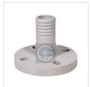
Pp Hose Nipple Flanged