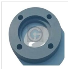
PP Tail Piece Flange