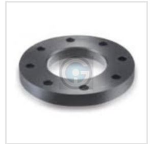
Hdpe Pipe Bore Flange