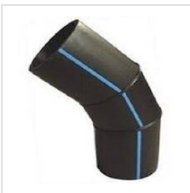
HDPE Fabricated Elbow