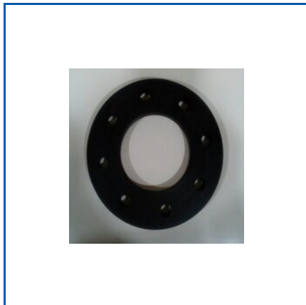
HDPE SLIP ON FLANGE