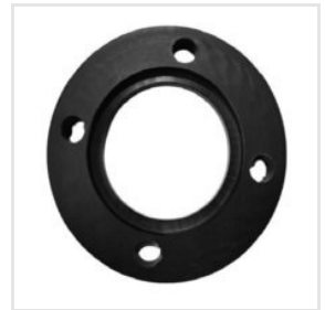
HDPE Tail Piece Flange