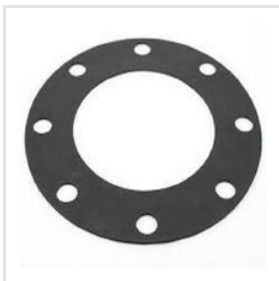
Rubber Flange Gasket