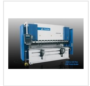
CNC Press Brake