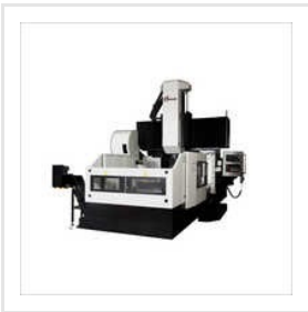
Maple Double Column Machining Center