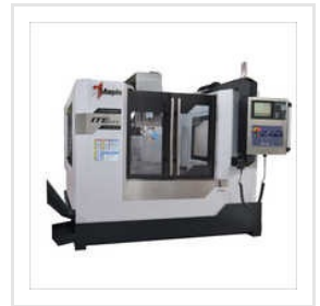
Maple ME Series VMC Machine