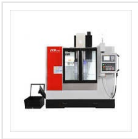
Maple MA-Series Vertical Machining