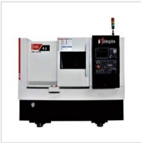
CNC Turning Machine