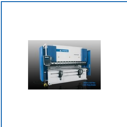
CNC PRESS BRAKE