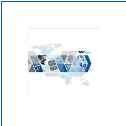
TURRET PUNCH TOOLING