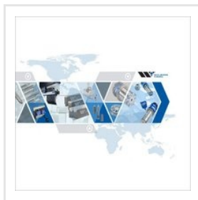
Turret Punch Tooling