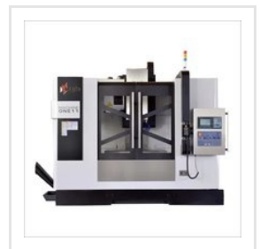
Maple M-ONE Series Vertical Machining