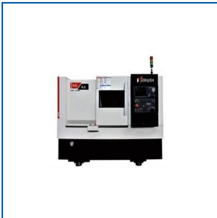
CNC TURNING MACHINE

Altra ZNC ORB, CNC Press Brake, CNC Turning Machine, Ear Loop Welding Machine, Face Mask Blanking Machine, Maple Double Column Machining Center, Maple M-ONE Series Vertical Machining Center, Maple MA-series Vertical Machining Center, Maple ME Series VMC Machine, Surface Grinder, Turret Punch Tooling, etc.