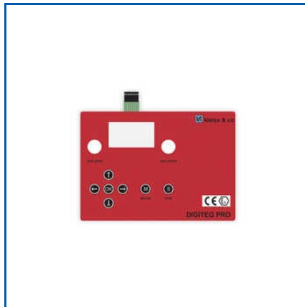
DIGITEQ PRO FLEXIBLE MEMBRANE KEYPADS