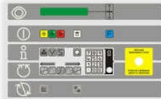
MP 00038 ZINSER 730 Standard Machine