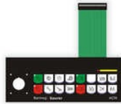
MP 00034 Barmagn Saurer ACW Standard