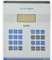
ACPL PCB Based Membrane Keypads