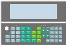
MP 00025 Tsudakoma Standard Machine