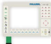
MP 00002 Picanol Omniplus Standard