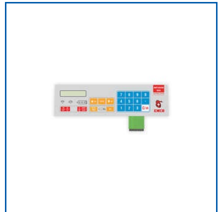
INFUSOR FLEXIBLE MEMBRANE KEYPADS