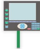
MP 00022 Tsudakoma Standard Machine