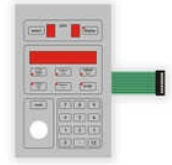
MP 00030 Reter Standard Machine