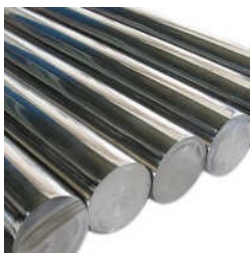
12CRMOV Round Steel