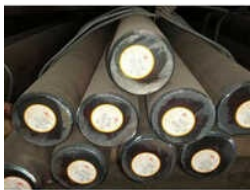
Steel Round Bar