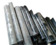
High Speed Steel Bar