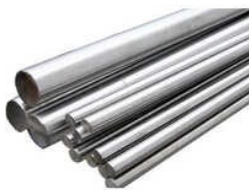
1.2083 Stainless Tool Steel Bar