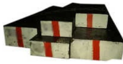
Flat Mold Steel