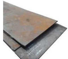
12CRMOV Square Steel