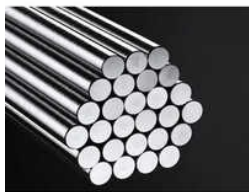
ENIA NON LEADED CUTTING STEEL

1.2083 Stainless Tool Steel Bar, 1.2714 Flat Die Block Steel, 1.2714 Round Die Block Steel, 1.2714 Square Die Block Steel, 12CRMOV Flat Steel, 12CRMOV Round Steel, 12CRMOV Square Steel, 52100 Grade Bearing Steel Round Bar, AISI 4140 Steel Bars, Alloy Steel Construction Bars, Alloy Steel Flat Bar, C45 Steel Plates, C45 Steel Sheets, Carbon Steel Plain Plates, Carbon Steel Sheet, etc.