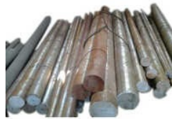
52100 Grade Bearing Steel Round Bar