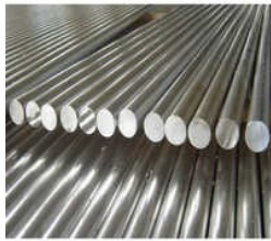
Mild Steel Bright Bars