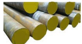
EN31 Round Bar