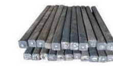
Alloy Steel Construction Bars