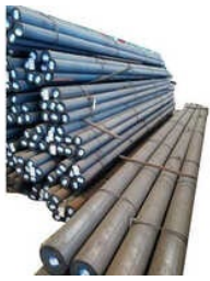
EN4340 Steel Rod