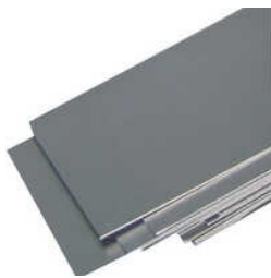
Carbon Steel Sheet