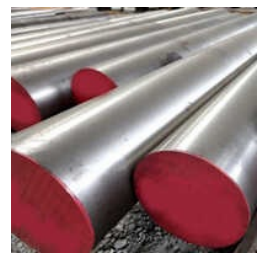
Cold Working Tool Steel Bar