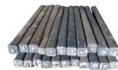
MS ALLOY STEEL