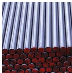
ENIA LEADED CUTTING STEEL BAR