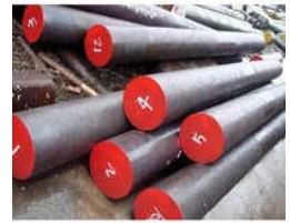
Hot Work Tool Steel Round Bar