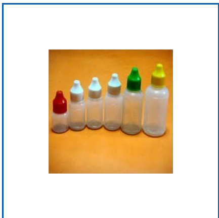
DROPPER BOTTLE SUPER CAPS