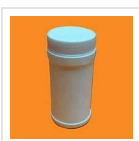
Tablet Container (120 MI)