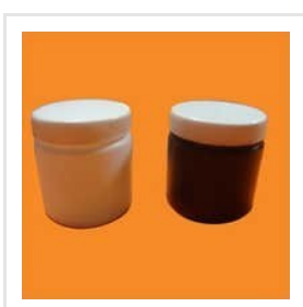
Povidine Pesticide Chemical Bottle