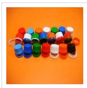
Pilfer Proof Caps (25 Mm)