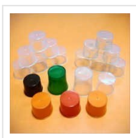
Pharma Measuring Caps