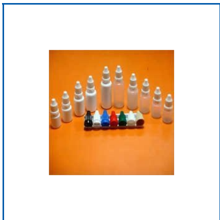
DROPPER BOTTLE WITH TAMPER PROOF CAP

Aromaz Shampoo Bottles, Capsule Container, Chemical Bottles, Crc Pilfer Proof Caps, Cream Jars, Dropper, Dropper Bottle, Dropper Bottle Super Caps, Dropper Bottle With Tamper Proof Cap, Dry Syrup Bottle, Dry Syrup Bottle (40 ml), Dry Syrup Bottle (60 ml), Flat Bottles, Flip Top Caps, Gel Jar Bottles, etc.