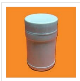
Tablet Container (100 MI)