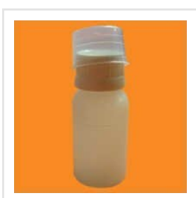
Dry Syrup Bottle