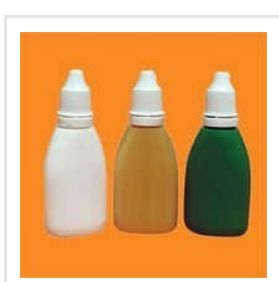
Nasal Spray Bottles