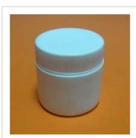
Tablet Container (40 MI)