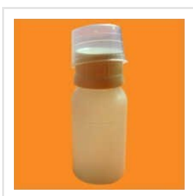
Dry Syrup Bottle (60 MI)