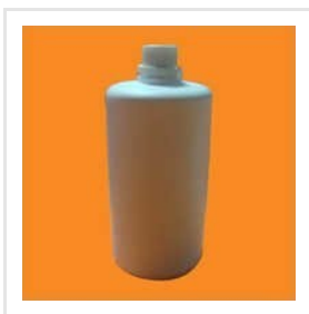
Povidine Pesticide Chemical Bottle (1)