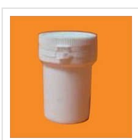
Crc Pilfer Proof Caps