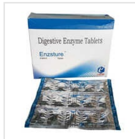
Digestive Enzyme Tablets