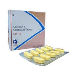
Ofloxacin And Ordinazole Tablets