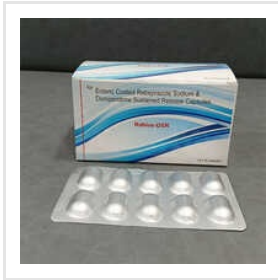
Enteric Coated Rabeprazole Sodium