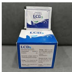
CHOLECALCIFEROL GRANULES SACHETS

Acebrophylline SR Tablets 200 mg, Acebrophylline-Sustained Release-Fexofenadine HCL And Montelukast Tablets, Aceclofenac And Paracetamol Tablets, Aceclofenac Paracetamol And Serratiopeptidase Tablets, Aceclofenac-As Sustained Release With Rabeprazole Sodium Tablets, etc.