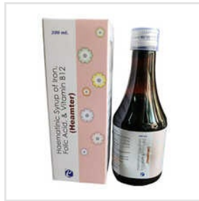
Haematinic Syrup Of Iron Folic Acid And