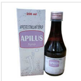
Appetite Stimulant Syrup 200 ML