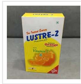
Lustre-IS Proprietary Food Powder 210 Gm