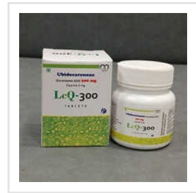
Ubidecarenone - Co- Enzyme Q10 300 Mg