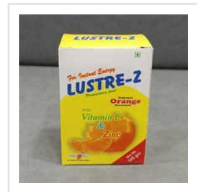
Lustre-IS Proprietary Food Powder 105 Gm