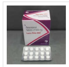
Paracetamol Tablets IP 650 Mg