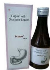
PEPSIN WITH DIASTASE LIQUID 200 ML