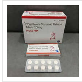
Progesterone Sustained Release