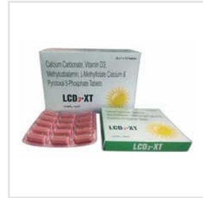
Calcium Carbonate Vitamin D3