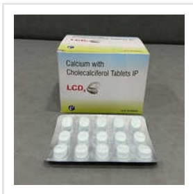
Calcium With Cholecalciferol Tablets