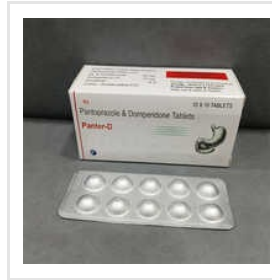
Pantoprazole And Domperidone Tablets