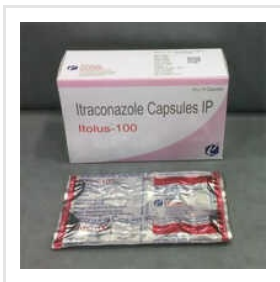
Itraconazole Capsules IP 100 Mg