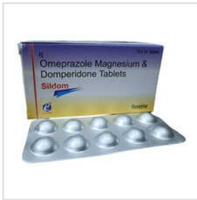
Omeprazole Magnesium And