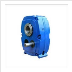
Fenner Shaft Mounted SMSR Helical