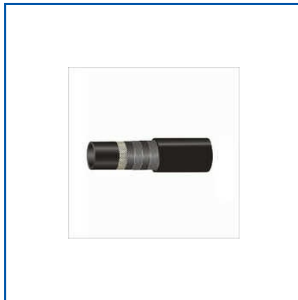
GATES SPIRAL HOSES