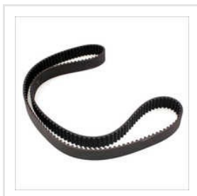
Fenner Timing Belts