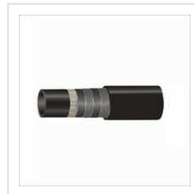
Gates Spiral Hoses