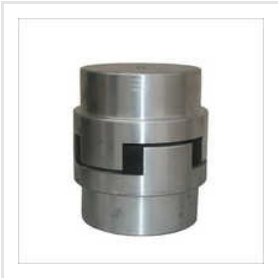
Fenner Star Couplings