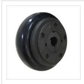
Fenner Tyre Couplings