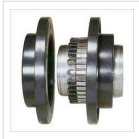
Fenner Resilient Couplings