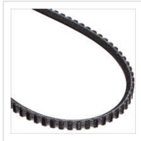
Poly V Belt