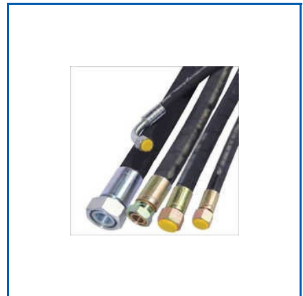
HIGH PRESSURE HYDRAULIC RUBBER HOSES PIPE