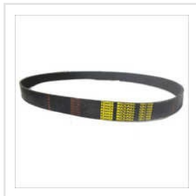
Fenner Poly F Plus V Belts