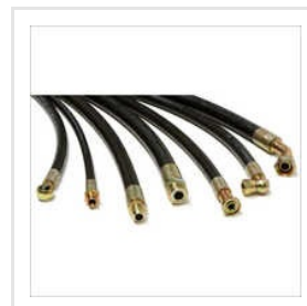
Gates Hydraulic Hoses