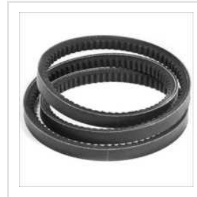
Fenner Banded Belts