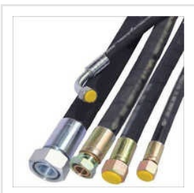
High Pressure Hydraulic Rubber