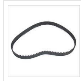
Variable Speed Belts