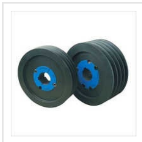
Fenner Taperlock V Belt Pulleys