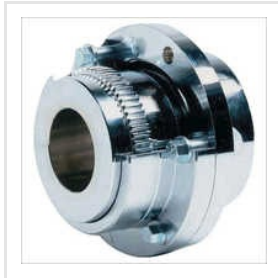
Fenner Gear Coupling