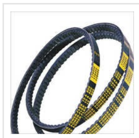
Fenner Auto Belts