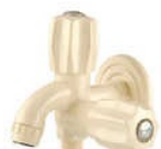
15mm Foam Flow 2 Way Bib Cock