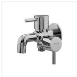
2 WAY DOUBLE HANDLE BIB COCK WITH FLANGE

Marvel, MFI & UTM, Nylon Red, PET Amber, Spectrophotometer Test, Tripolene Blue, Twin Screw Extruder, etc.