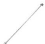
450 Mm Copper Connection Pipe With