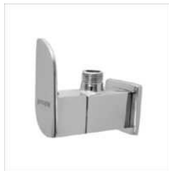
CP ANGLE COCK WITH FLANGE