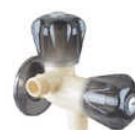
15mm 2 Way Angle Cock With Flange