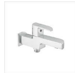
2 WAY SINGLE HANDLE BIB COCK WITH FLANGE