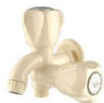
15mm (RH) WF 2 Way Bib Cock