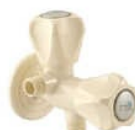
15mm 2 In 1 Angle Cock With Flange