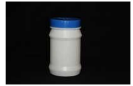
Wide Mouth Container For Powder