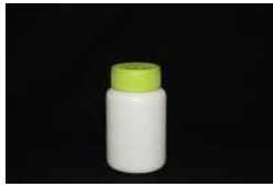
100ml Wide Mouth Round Bottle