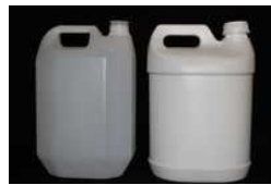
5 Ltr Jerry Can