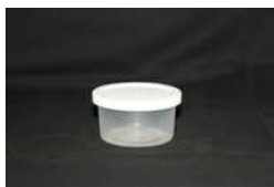
Small Cup For F And B