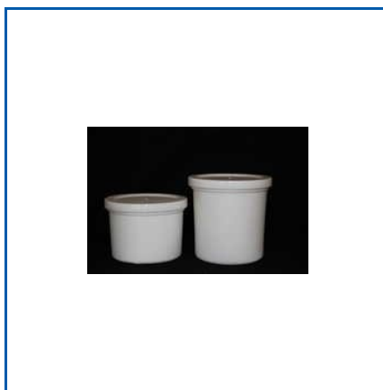
WIDE MOUTH CONTAINER WITH PRESS FIT CAP PRESS