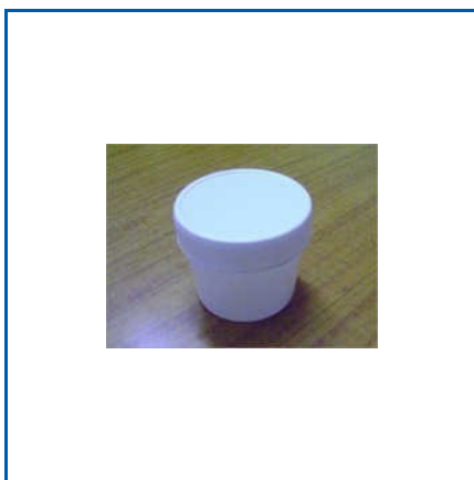
PLASTIC PACKAGING CONTAINERS

square small jar, taper neck bottles, 100ml Wide mouth round bottle, 2.2 Ltr Jar, 5 Ltr jerry can, Container for liquids, Cream jars, Cylindrical Round HDPE Bottles, Cylindrical Round HDPE Bottles Pilfer Proof Caps, HDPE Bucket, HDPE Bucket with Lid, HDPE Container for Medicines, HDPE Jar, HDPE Plastic Jars, Jerry Can, etc.