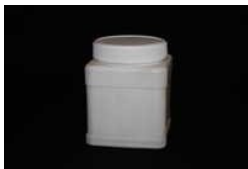
Square Small Jar