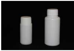
Narrow Mouth Small Bottle