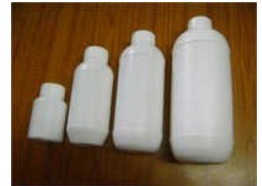
White Plastic Containers