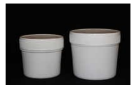
Wide Mouth Taper Type Hdpe Container