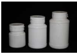
Tablet Container With Tear Off Cap