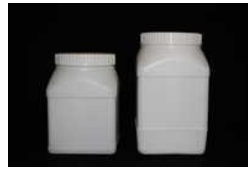
Large Jars For Powder