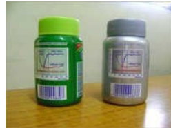
Plastic Jars With Lids