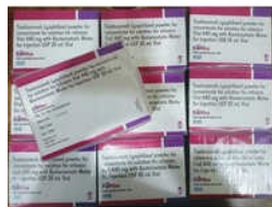
Trastuzumab Lyophilized Powder For