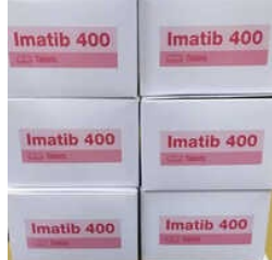
400mg Imatinib Tablets IP