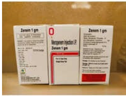
1g Meropenem Injection IP