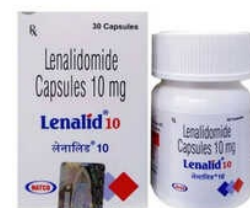
10MG LENALIDOMIDE CAPSULES