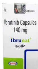
140mg Ibrutinib Capsules