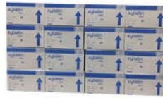
1MU Colistimethate Sodium Injection