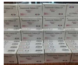
Anastrozole Tablets IP