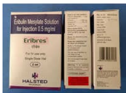
Eribulin Mesylate Solution For Injection