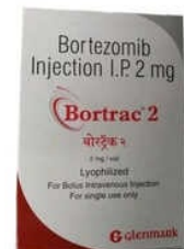
2mg Bortezomib Injection IP