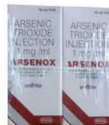
1mg Arsenic Trioxide Injection