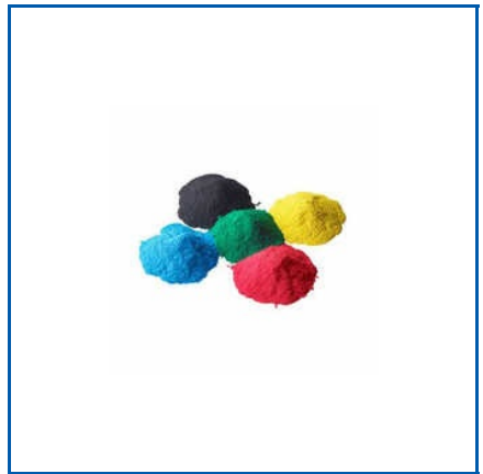
INDUSTRIAL POWDER COATING POWDER