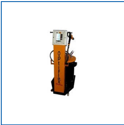
MANUAL POWDER COATING GUN

Industrial Powder Coating Powder, Manual Powder Coating Gun, YBI Semi Synthetic Cutting Oil, etc.