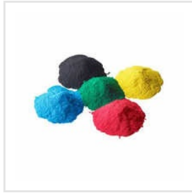
Industrial Powder Coating Powder