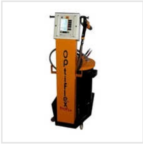
Manual Powder Coating Gun